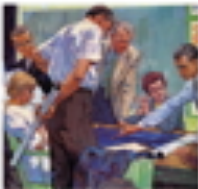
Illustration © iStockphoto.com