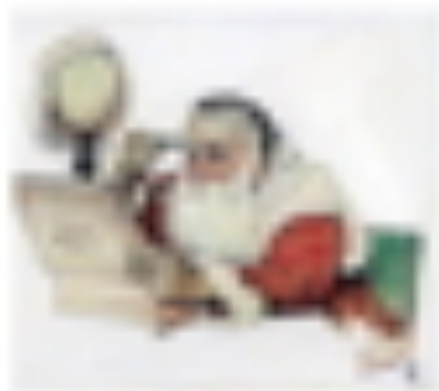
Illustration by the Famous Artists of the Illustrated Gallery, Inc.