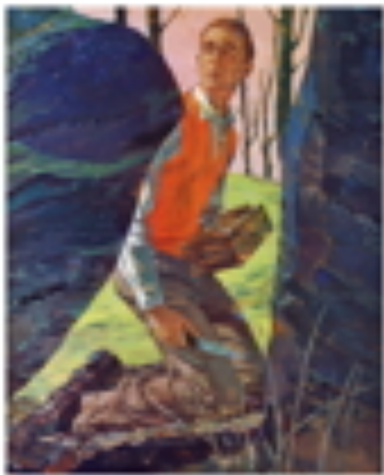
A Man with a Dog in a Forest, 1885