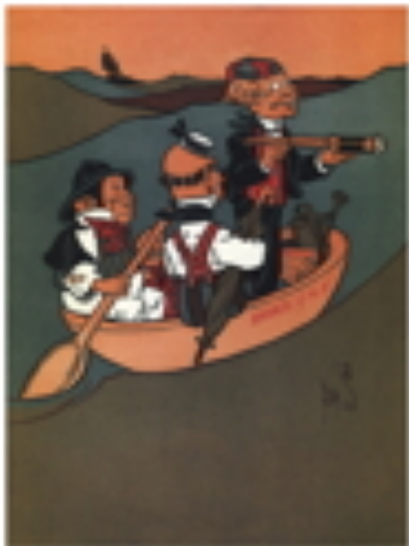
Illustration by Tom Swick. © 2011 Tom Swick.