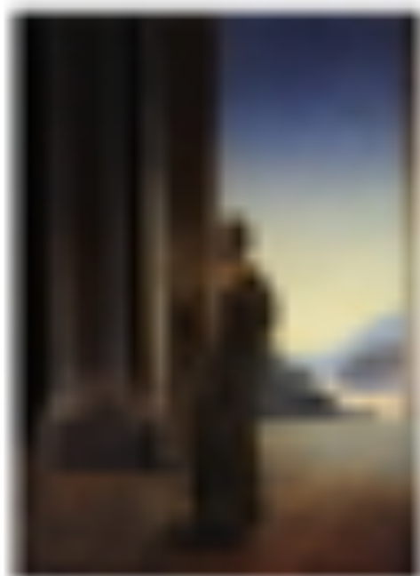
Illustration by the Famous Artists of the Illustrated Gallery, Inc.