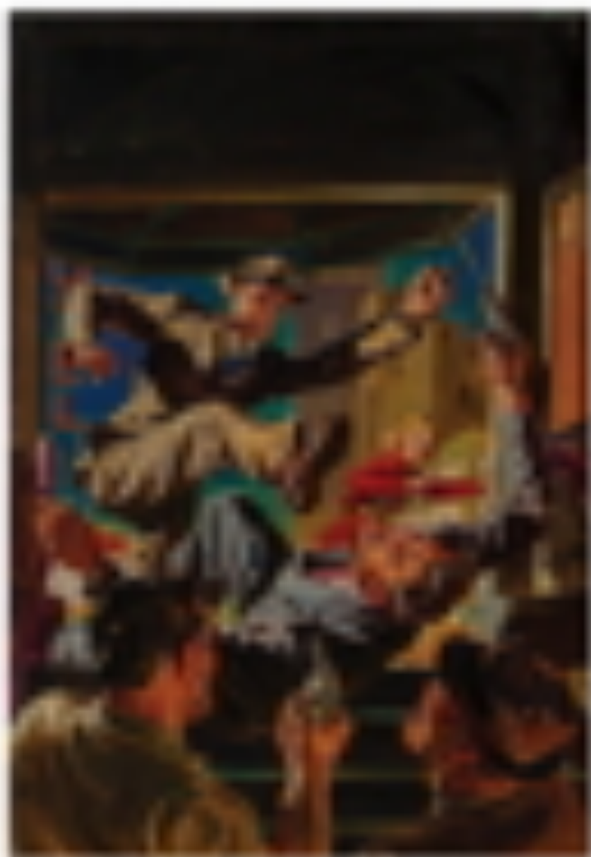
Howard Chandler Christy, The Spirit of '76 , 1877

Now Accepting Consignments | Deadline: February 18