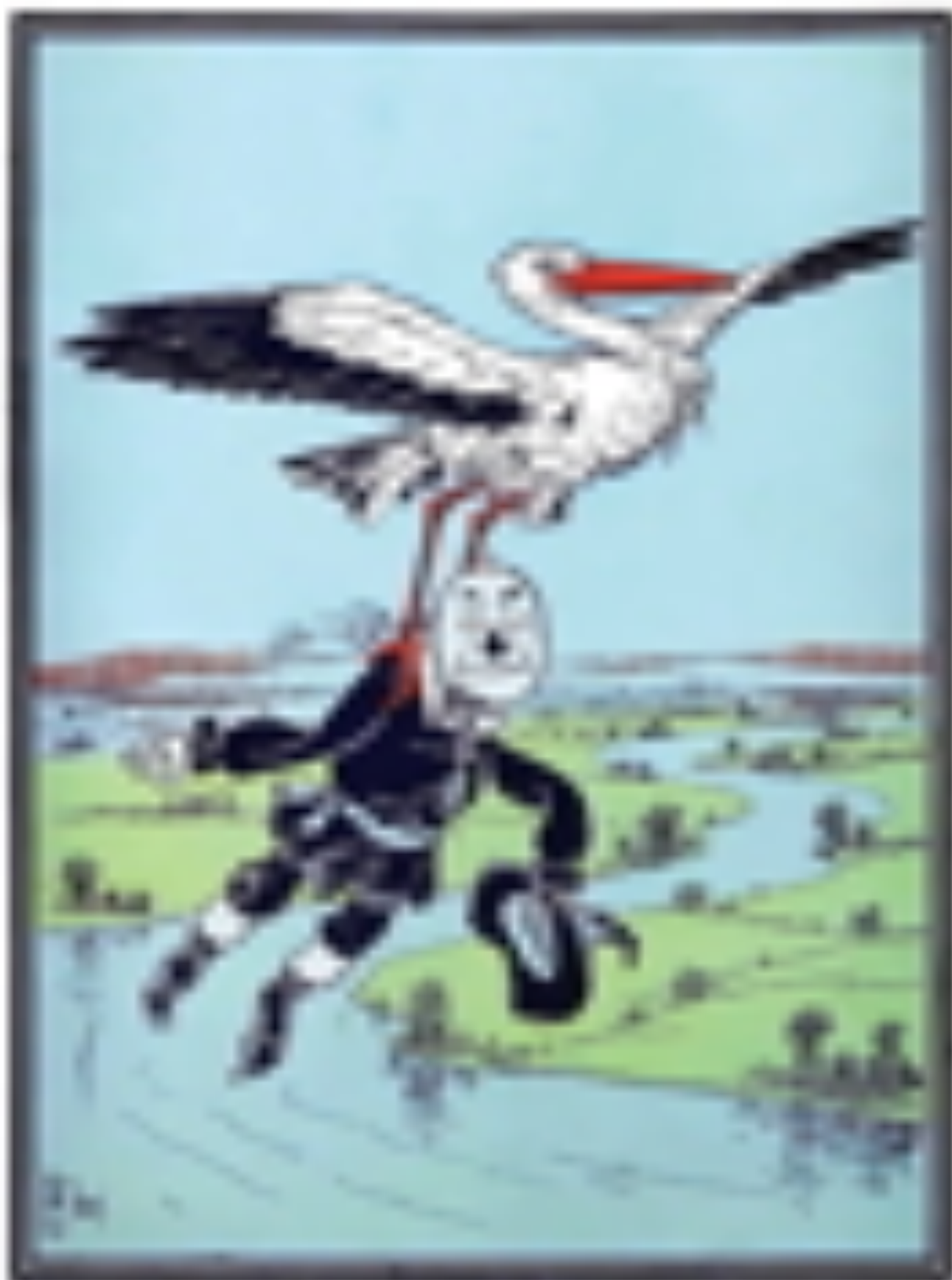
Illustration by [unreadable]