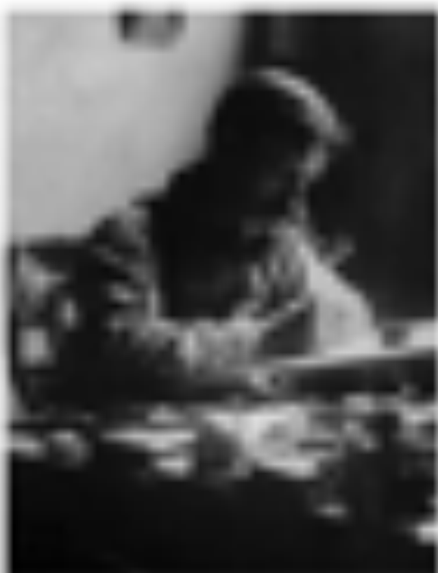
THE WORLD OF WONDERFUL WONDERS