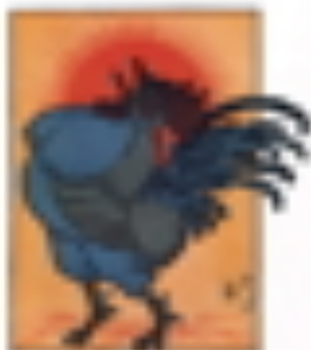
Illustration by [unreadable]