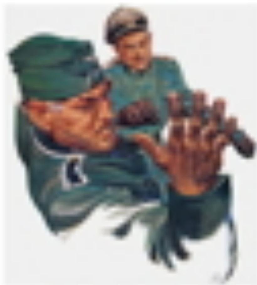
Illustration © iStockphoto.com