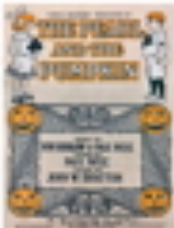
Illustration of the 1911-1912 season.