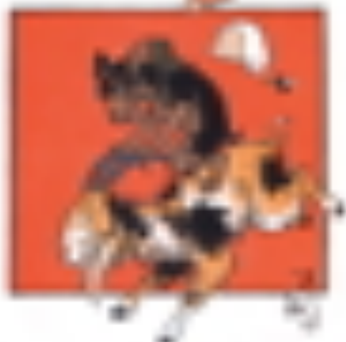
Illustration by [unreadable]

The rooster is a symbol of courage and strength. It is often used in heraldry and is a common motif in art and literature. The rooster is also a popular pet and is often kept in backyards. The rooster is a member of the Gallinae suborder of the order Galliformes. It is characterized by its large, colorful comb and wattle. The rooster is known for its loud crowing and its ability to protect its flock.