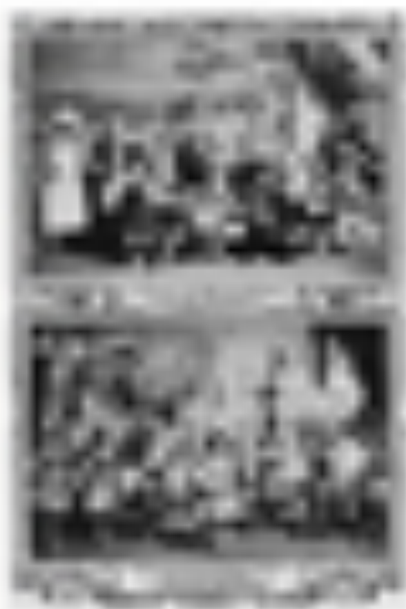
Illustration of the 1911-1912 season.

The 1911-1912 season was a very successful one for the team. They won many games and finished the season with a record of 10 wins and 2 losses. This was a great achievement for the team and a testament to their hard work and dedication. The team was led by Coach [Name] and the players were all very talented and hardworking. The season was a great one for everyone involved and it was a pleasure to be a part of it.