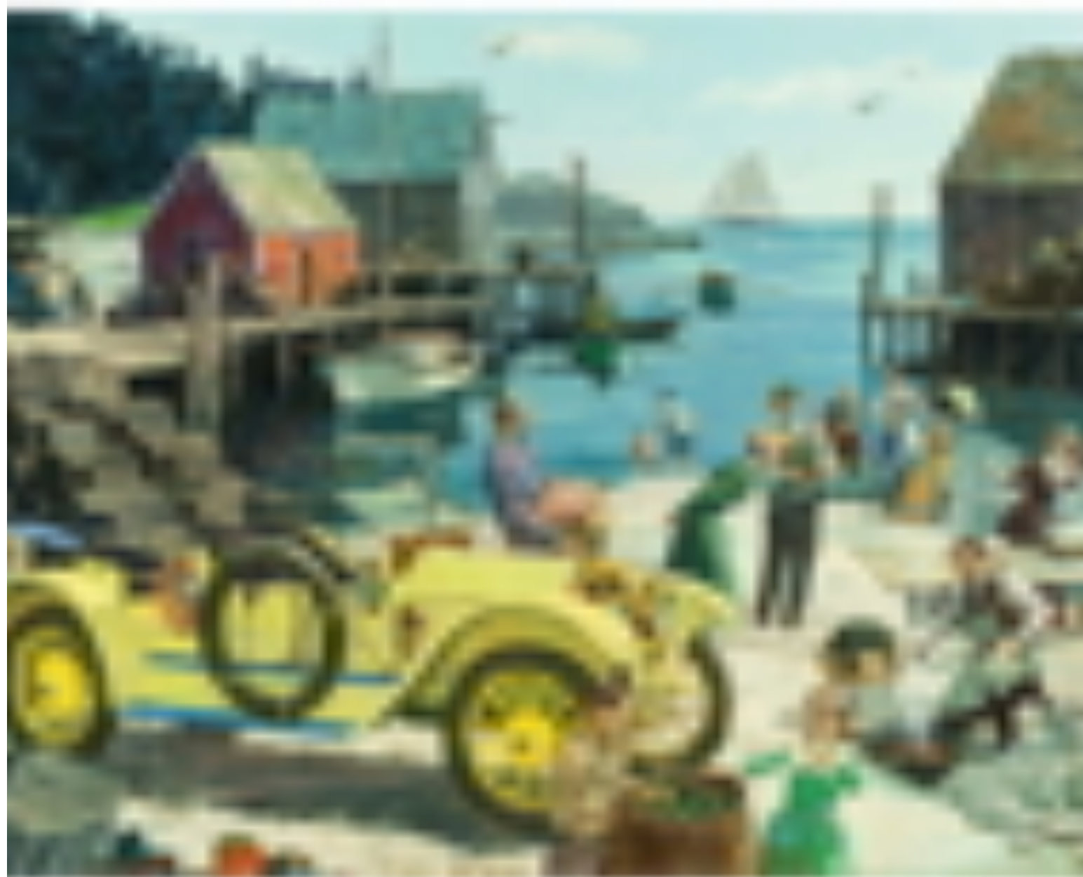
Impressionist painting of a busy beach scene with a yellow car and a red barn.

The first impressionist painting was created in 1866 by the French painter Eugène Delacroix. It was titled 'The Execution by guillotine' and depicted a scene of violence during the French Revolution. The painting was a departure from the traditional academic style of the time, which emphasized clear lines and a focus on narrative. Delacroix's use of color and light was revolutionary, and it paved the way for the Impressionist movement.