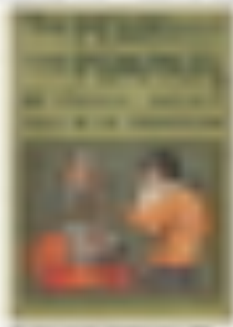
Illustration of the 1911-1912 season.

The 1911-1912 season was a very successful one for the team. They won many games and finished the season with a record of 10 wins and 2 losses. This was a great achievement for the team and a testament to their hard work and dedication. The team was led by Coach [Name] and the players were all very talented and hardworking. The season was a great one for everyone involved and it was a pleasure to be a part of it.