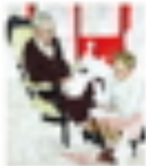
Illustration by the Famous Artists of the Illustrated Gallery, Inc.