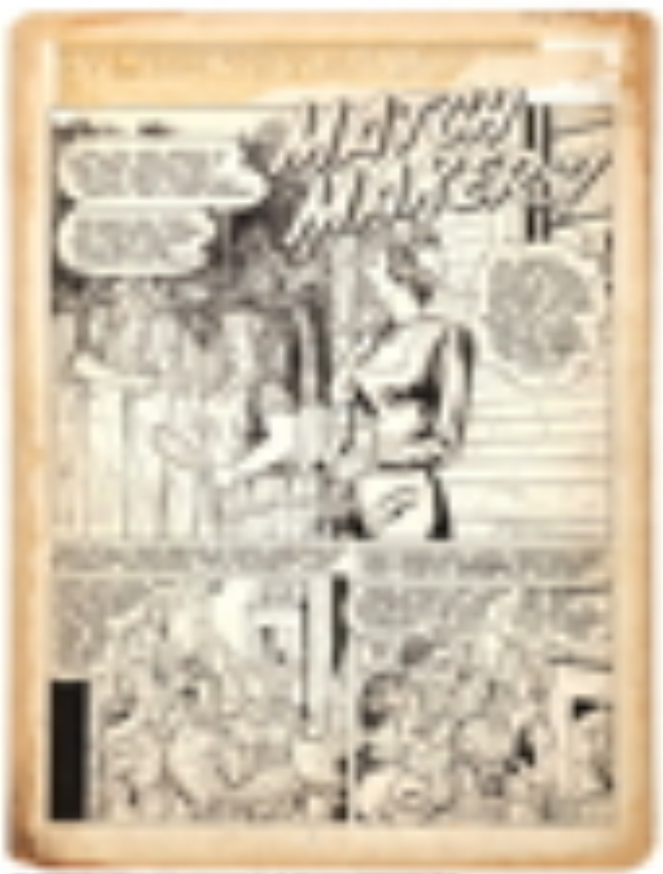
WOODEN TRAY WITH RELIEF CARVING OF A SCENE WITH SEVERAL FIGURES