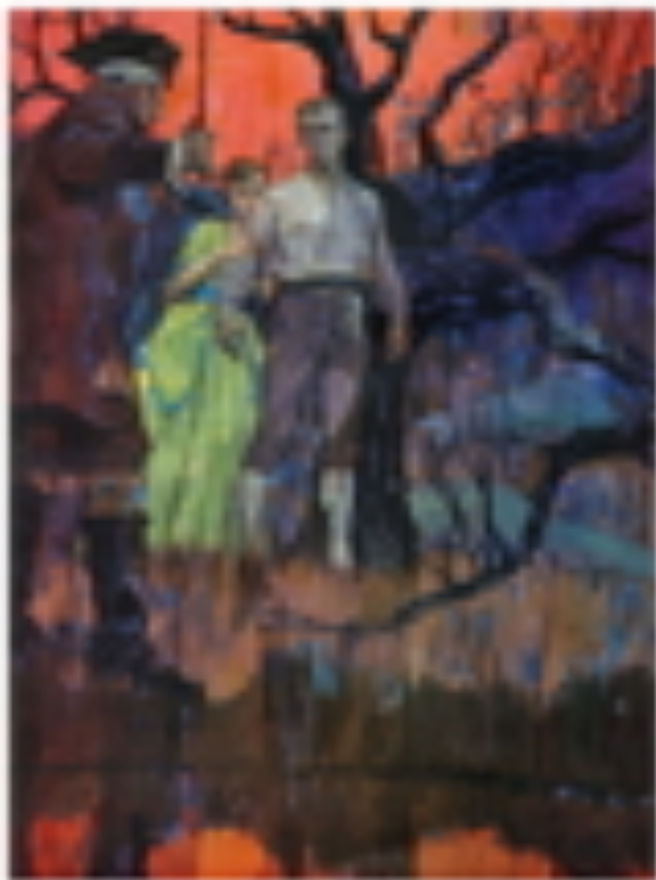
THE OLD MAN WITH A HOE, 1890, VAN GOGH