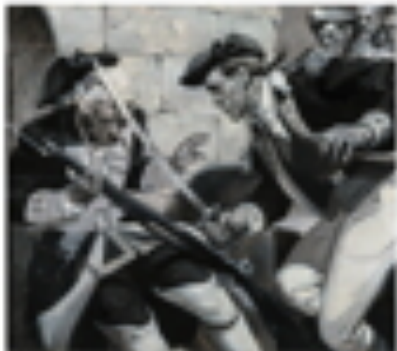
Illustration by [unreadable]