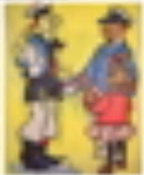
Illustration by [unreadable]

The cowboy is a symbol of the American West. He is often depicted as a brave and skilled rider. The cowboy is a member of the equestrian suborder of the order Artiodactyla. It is characterized by its large, colorful comb and wattle. The cowboy is known for its loud crowing and its ability to protect its flock.