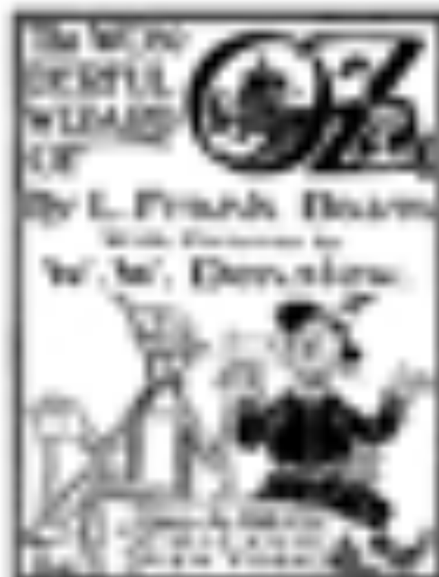
THE WORLD OF WONDERFUL WONDERS