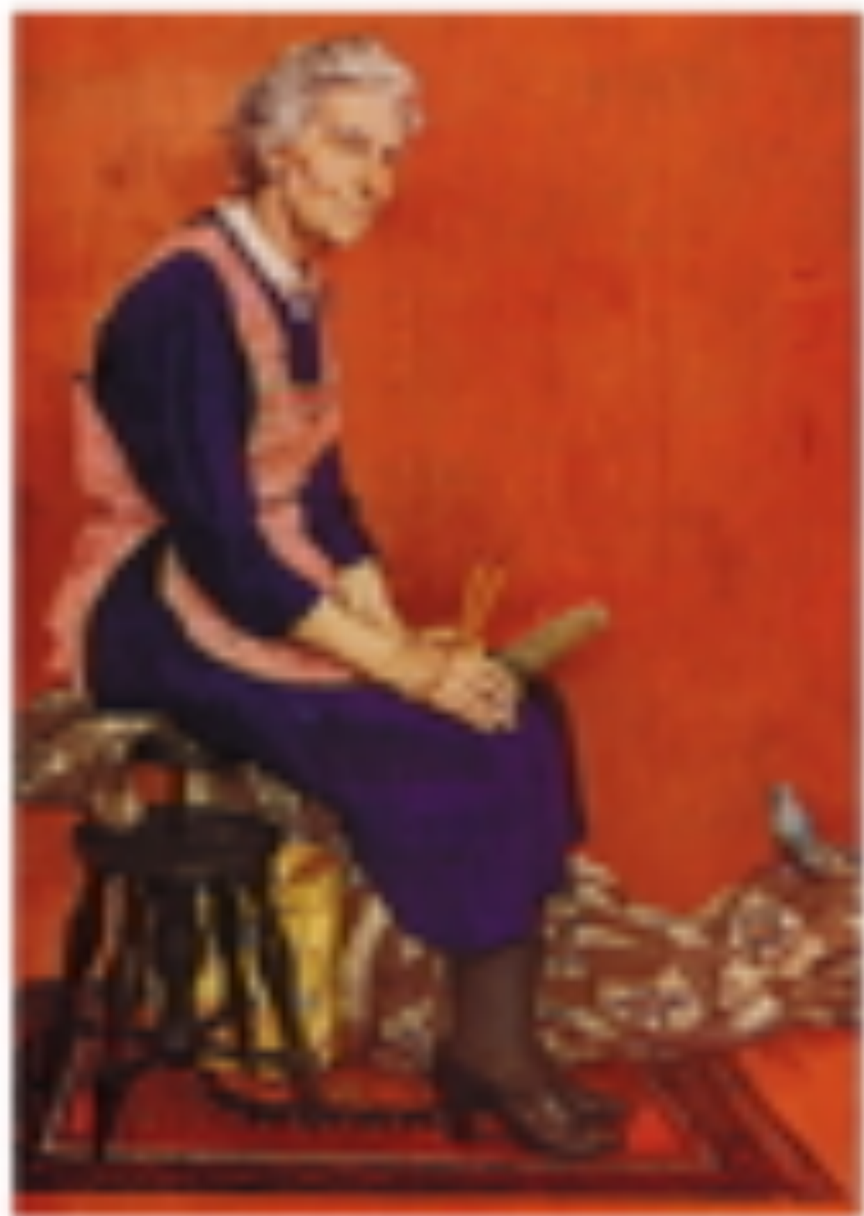
Portrait of an elderly woman, 1900, by J.M.W. Turner