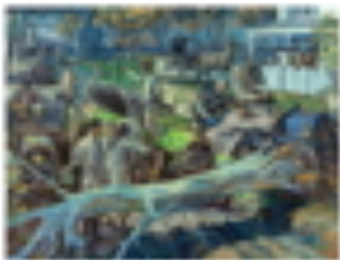
John Constable, 'The Hay Wain', 1821, oil on canvas, National Gallery, London.