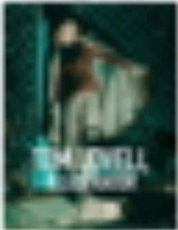
THE SANDLOT: SWEET SIXTEEN