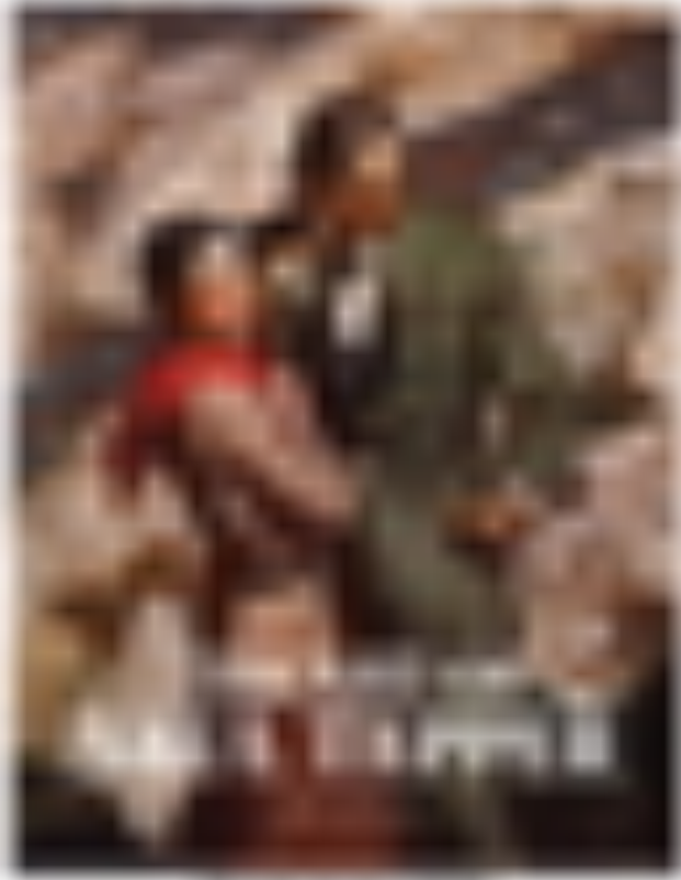
THE SANDLOT 2