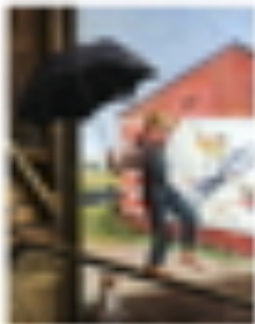
Illustration by the Famous Artists of the Illustrated Gallery, Inc.