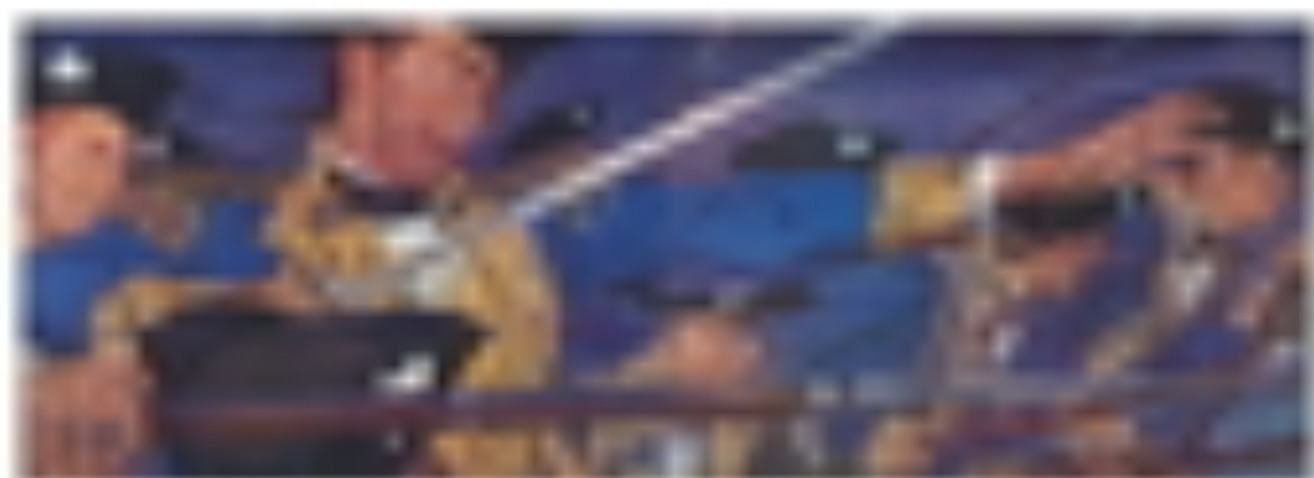
Illustration by [unreadable]