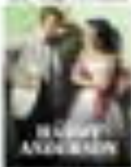
IN COUNTRY RATED R