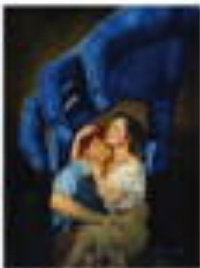
Model: [unreadable] / [unreadable]