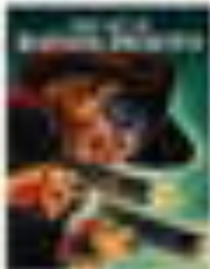
THE UNTOUCHABLES RATED R