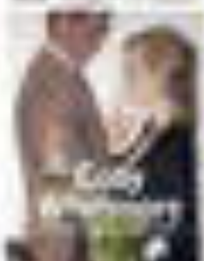
CODY RATED R