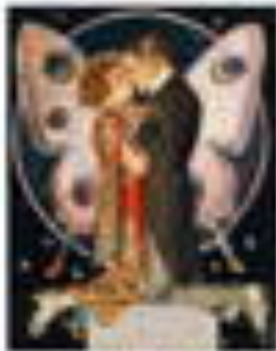
Illustration of a woman in a red dress from the book "The Illustrated Gallery" (1911)