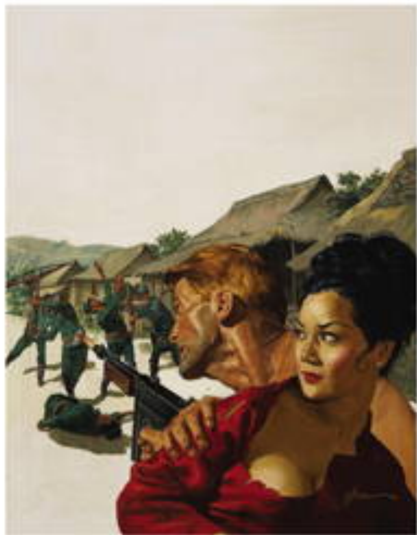
The American Soldier (1942) (curry) (oil on canvas) 27" x 36" (Photography of the original work)