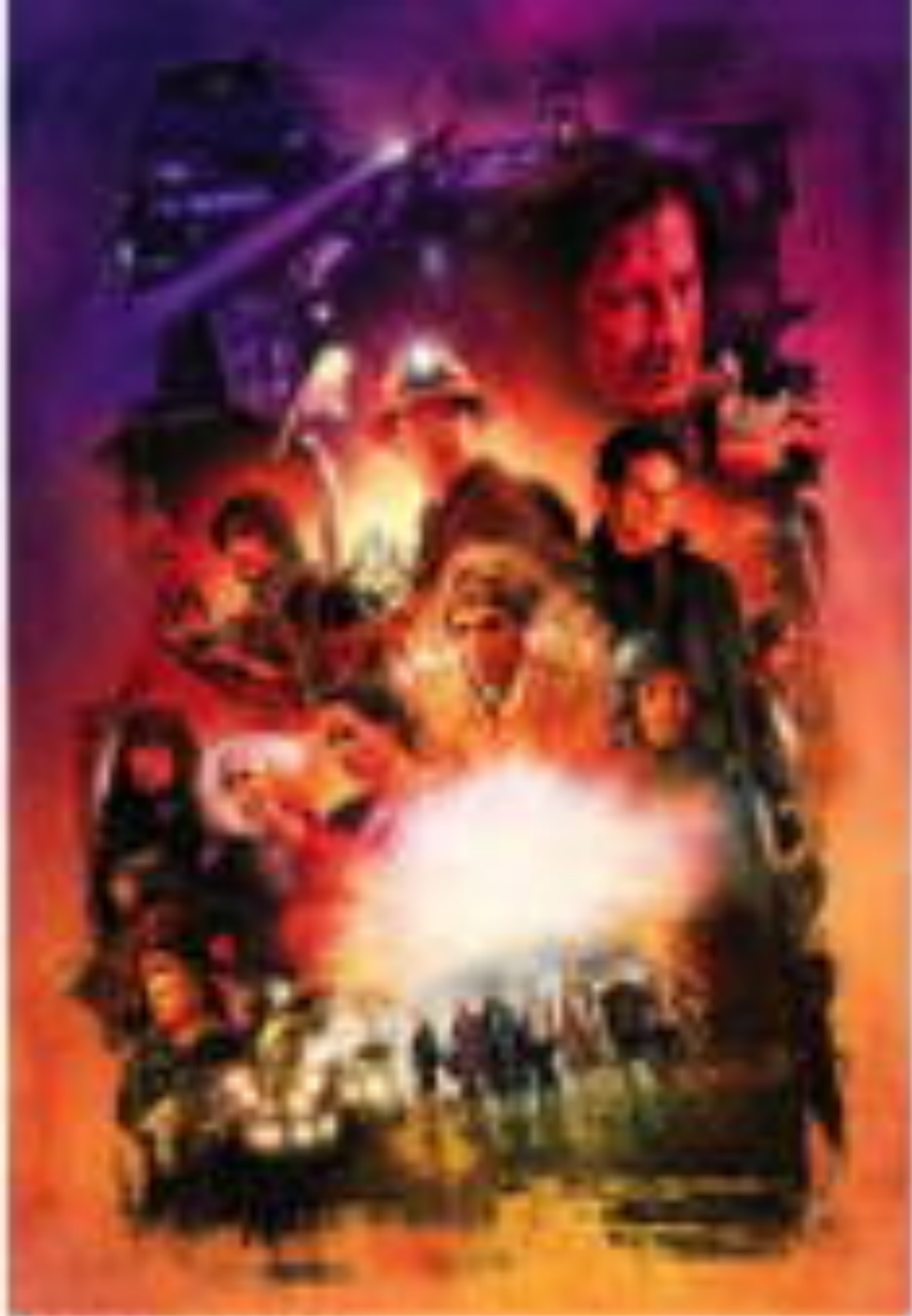
Illustration by [unreadable]