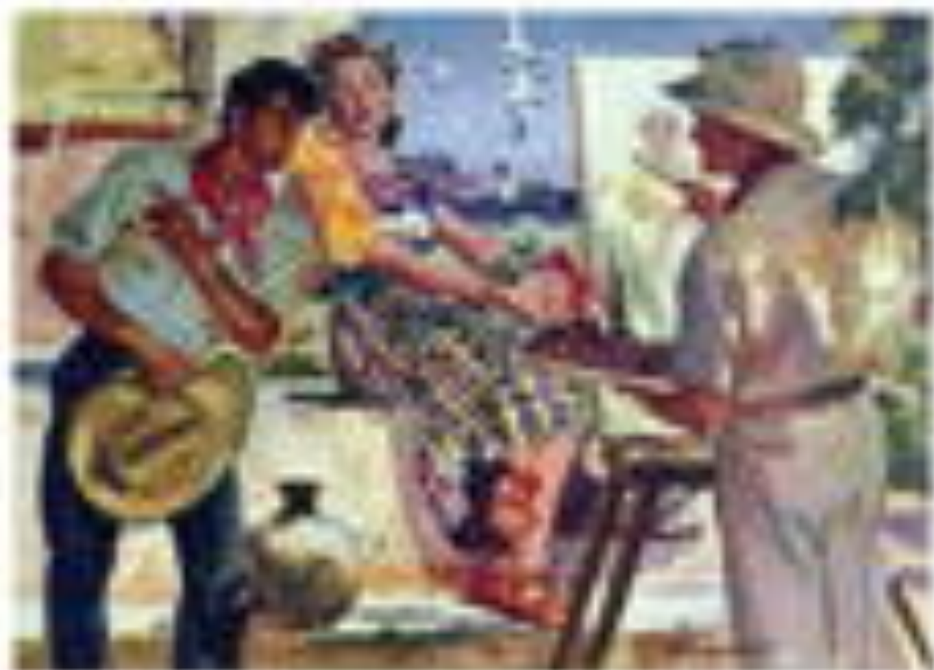
Illustration by [unreadable]

The artist's use of color is vibrant and expressive, capturing the energy of the scene. The composition is dynamic, with figures engaged in various activities, suggesting a bustling market environment. The style is reminiscent of mid-20th-century social realist art, emphasizing the lives of ordinary people.