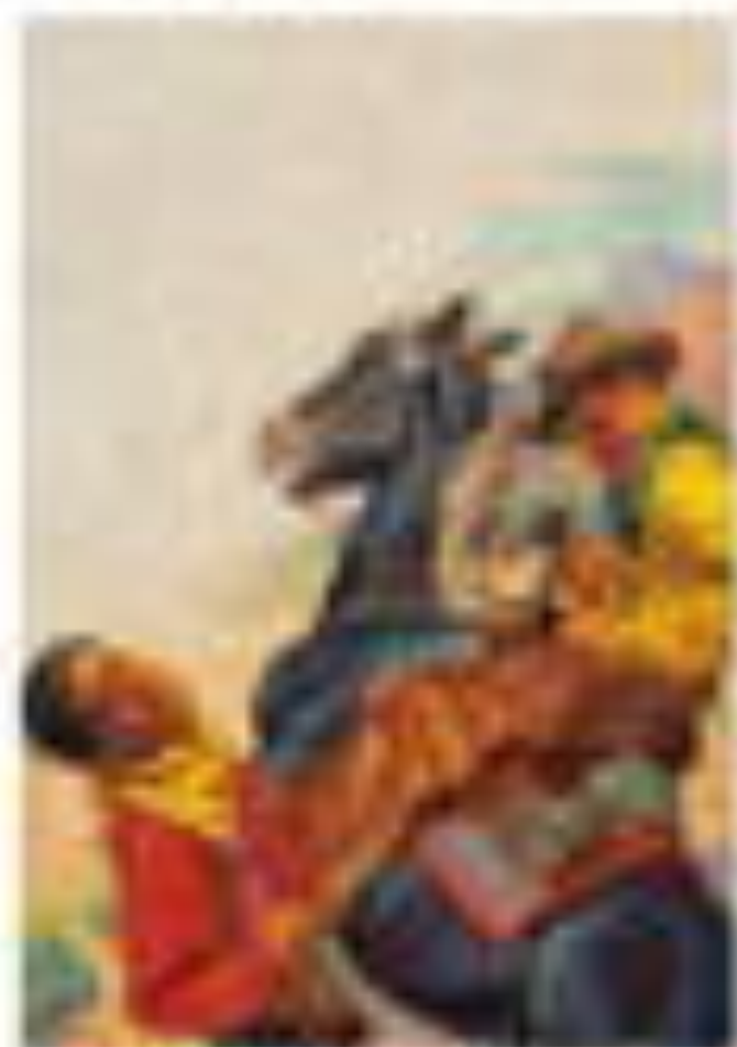
Illustration showing a scene from the novel 'Northwest' by Zane Grey. The man in the red shirt is the protagonist, and the man in the yellow shirt is a friend or ally.

I went to the window and looked out. The sun was shining. I felt better. I went to the window and looked out. The sun was shining. I felt better. I went to the window and looked out. The sun was shining. I felt better. I went to the window and looked out. The sun was shining. I felt better.