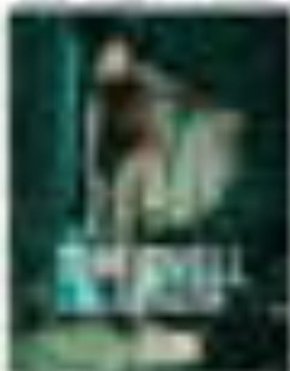
THE FALL RATED R