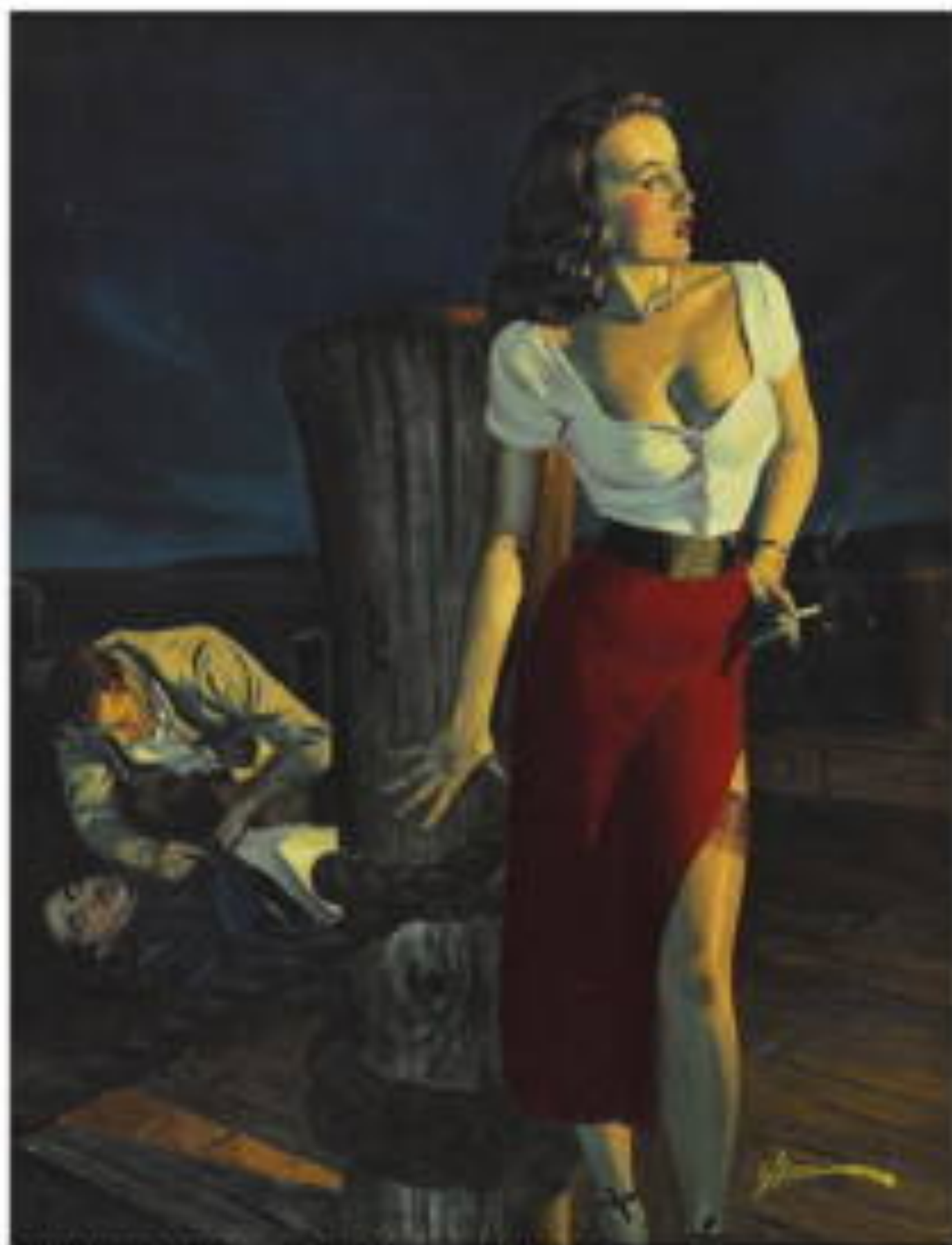
Red Hot and Sexy (May 1933) Oil on canvas, 60" x 60" (Gift courtesy of George Petty's Estate)