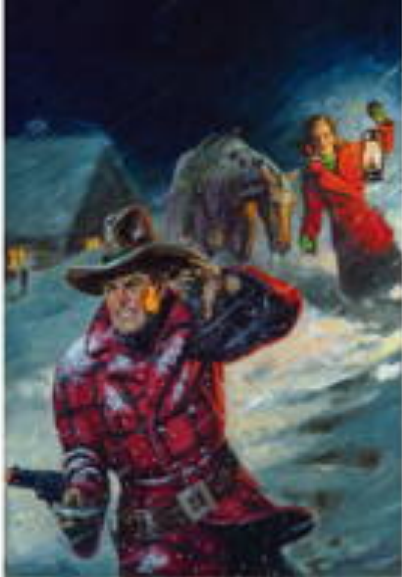
Illustration by the artist who designed the cover of the first issue of the magazine.

The illustration is a reproduction of the original artwork by the artist who designed the cover of the first issue of the magazine.