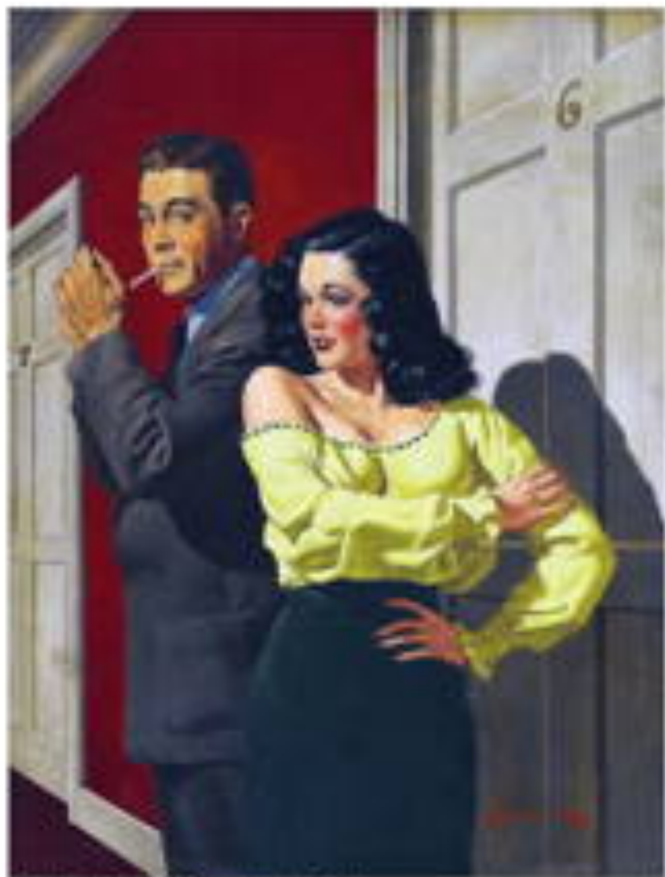
Illustration by [unreadable] for [unreadable] magazine, [unreadable] year.