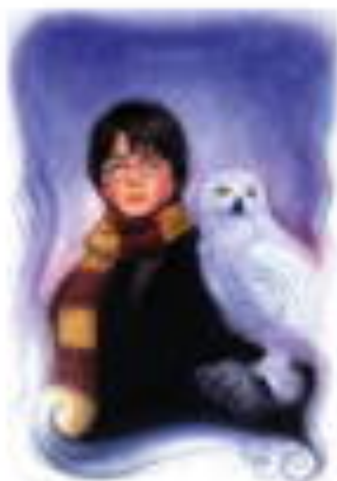
Illustration by [unreadable] and [unreadable]

...the owl is a very old friend of mine. I found her one day in a tree in the woods. She was very small and very shy. I found her one day in the woods and she was very small and very shy. I found her one day in the woods and she was very small and very shy.