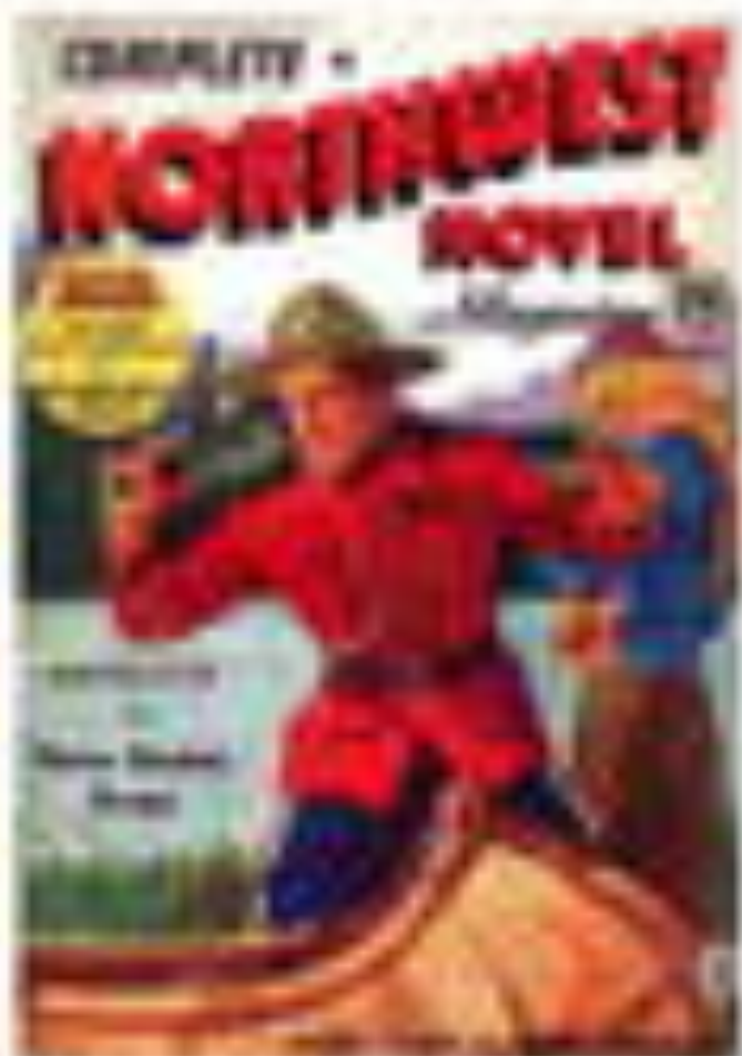
Book cover for 'Northwest' by Zane Grey. The cover features the title 'NORTHWEST NOVEL' in large red letters, with 'ZANE GREY' above it. The illustration shows a man in a red shirt and blue pants riding a brown horse, with another man in a blue shirt riding a grey horse behind him.

I went to the window and looked out. The sun was shining. I felt better. I went to the window and looked out. The sun was shining. I felt better. I went to the window and looked out. The sun was shining. I felt better.