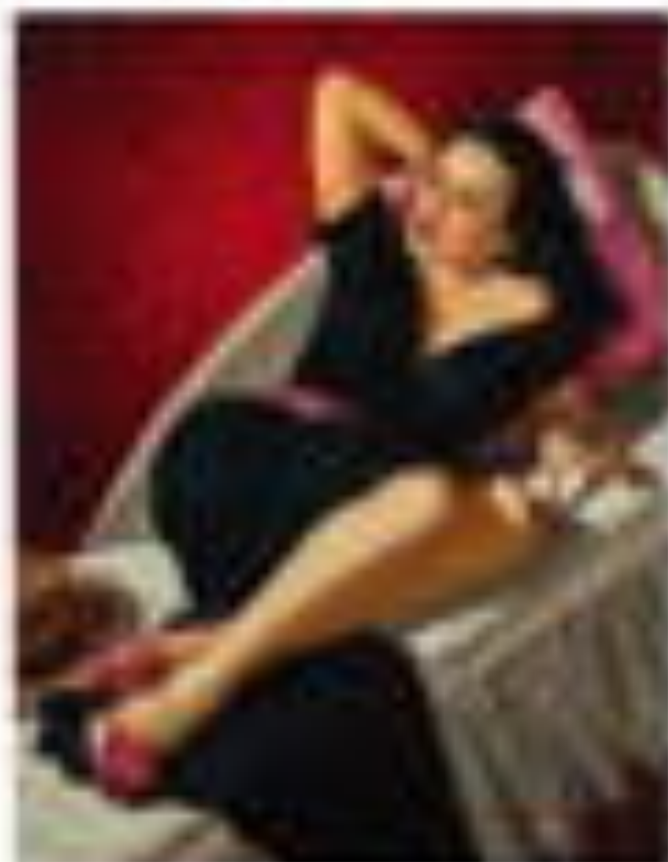
Model: [unreadable] / [unreadable]