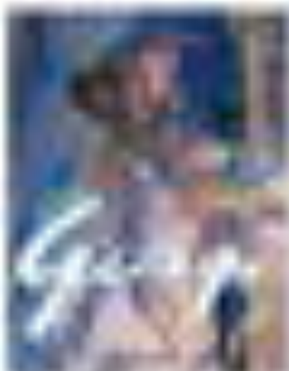
THE UNTOUCHABLES RATED R