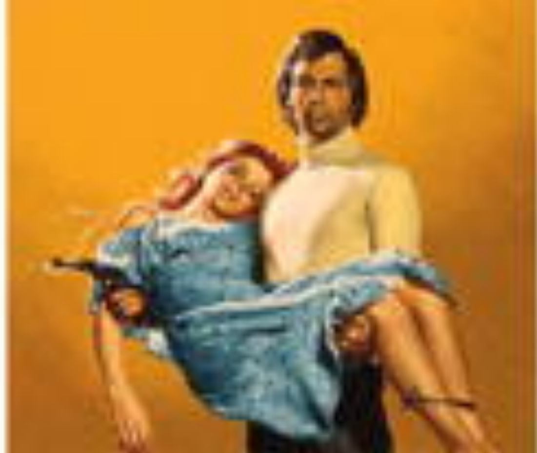
Source: © Shutterstock.com. All rights reserved. No reuse or distribution allowed.