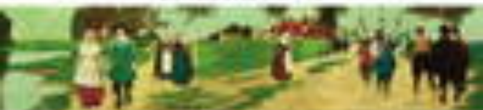
Illustration by [unreadable] at [unreadable]