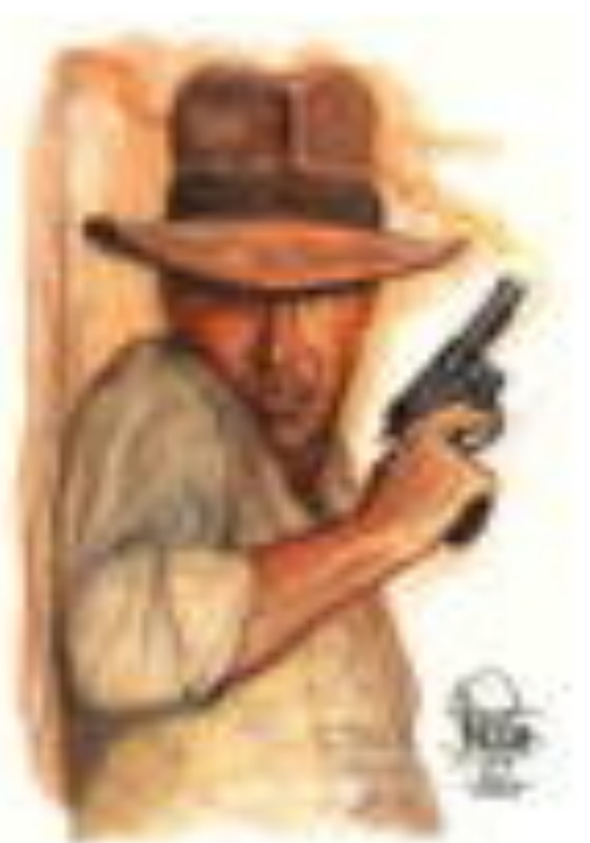
Illustration by [unreadable] and [unreadable]

I remember it so well. I was sitting in the woods one day and I saw a small owl sitting on a tree. I was very shy and I was very small. I found her one day in the woods and she was very small and very shy. I found her one day in the woods and she was very small and very shy.