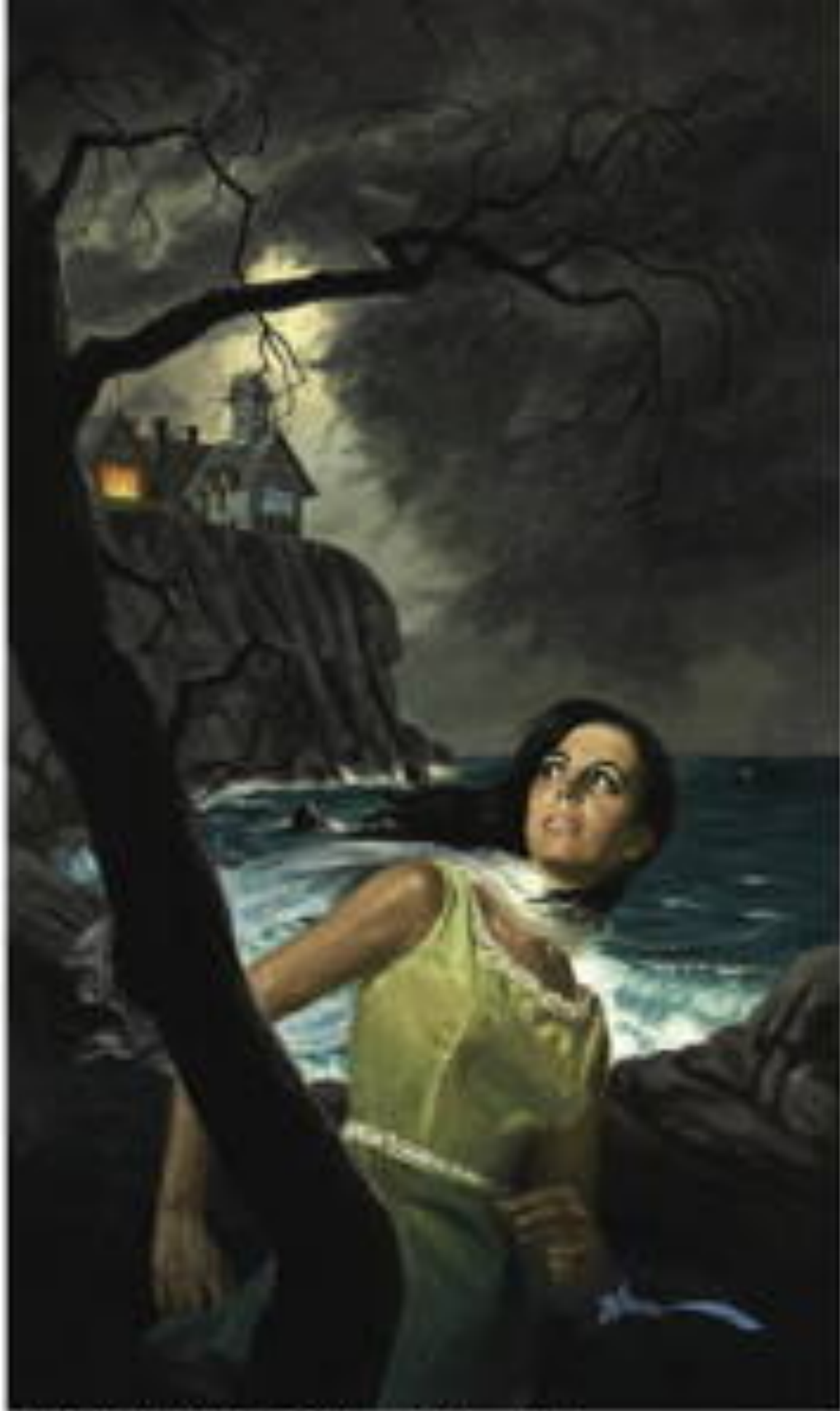
Illustration by [Name] for [Publication] featuring [Character Name].