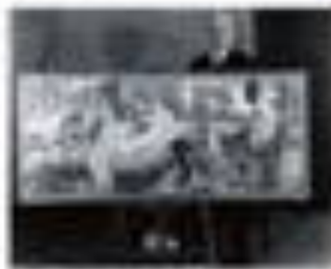
Western scene photograph

The Western genre has a long history of capturing the imagination of readers. From the early days of pulp magazines to the modern era of comic books and television, the Western has remained a popular and enduring genre. The stories often focus on the adventures of cowboys, outlaws, and settlers in the rugged landscapes of the American West.