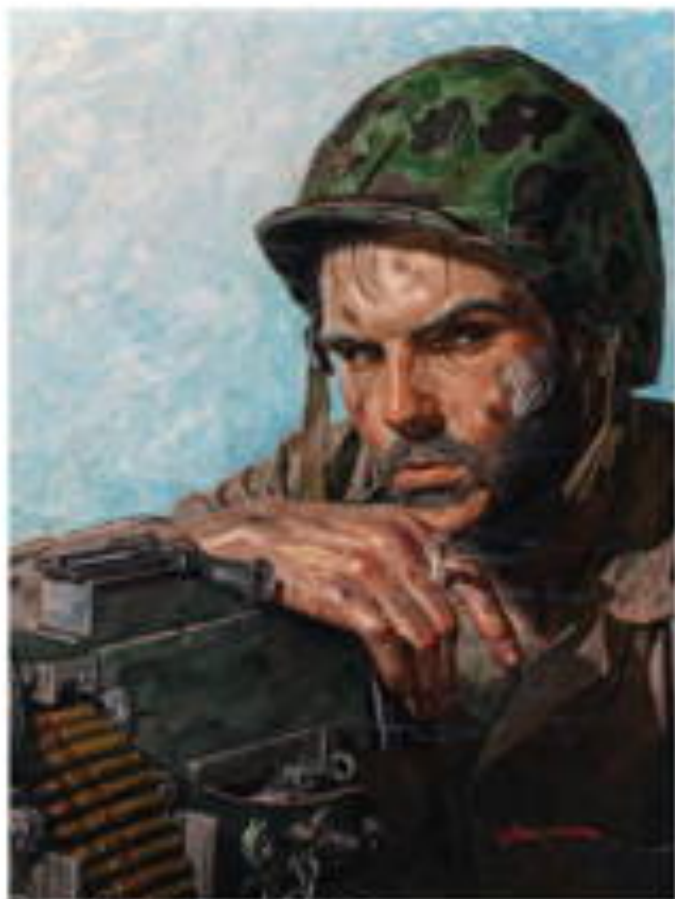
Oil on canvas, 1985. 48 x 60 cm. © 1985. The artist's estate. Artforum, 1985, p. 100.