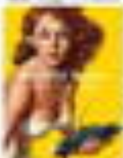
THE UNTOUCHABLES RATED R