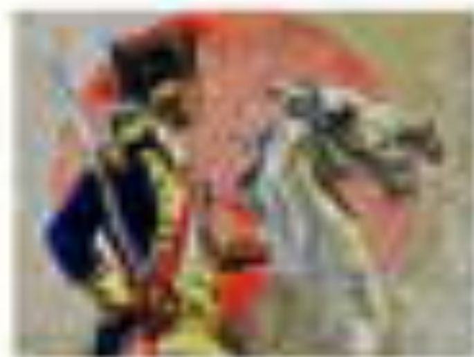
Illustration of a man and woman from the book "The Illustrated Gallery" (1911)