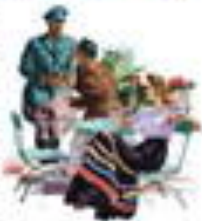
Illustration by [unreadable]