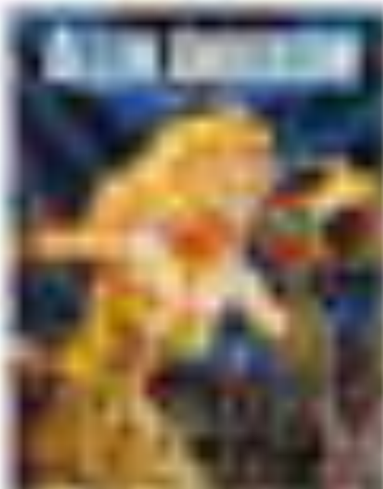
A STAR IS BORN RATED R