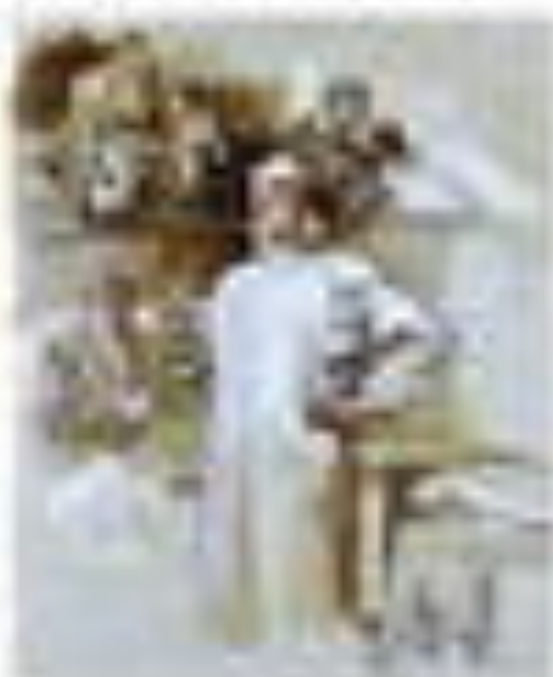
Illustration of a woman from the book "The Illustrated Gallery" (1911)