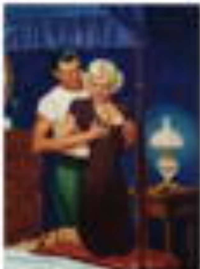
Model: [unreadable] / [unreadable]