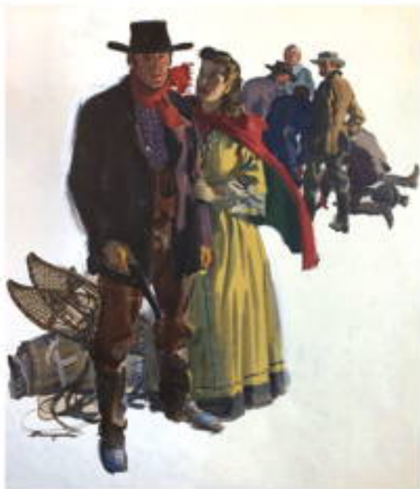
Illustration by John S. Sargent (copyright © 1902) Reprinted with permission of the artist's estate.