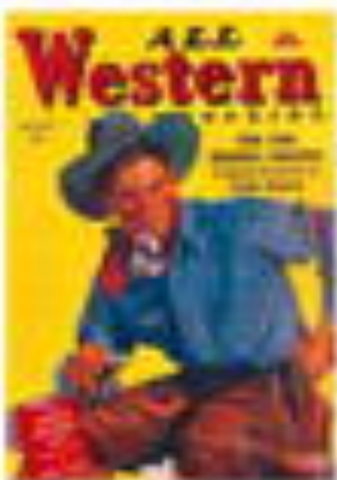
All Western magazine cover