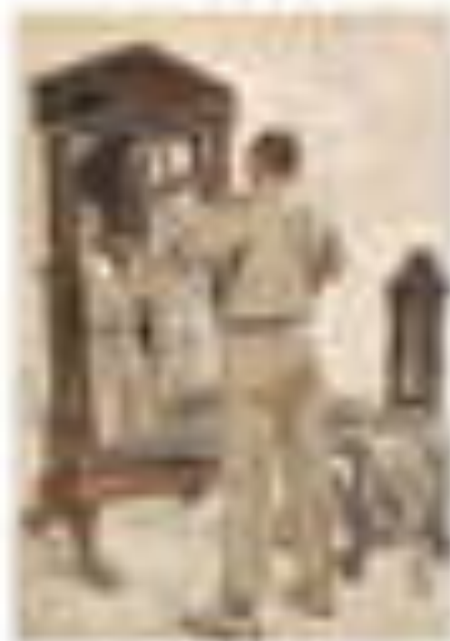
Illustration of a man in a suit from the book "The Illustrated Gallery" (1911)