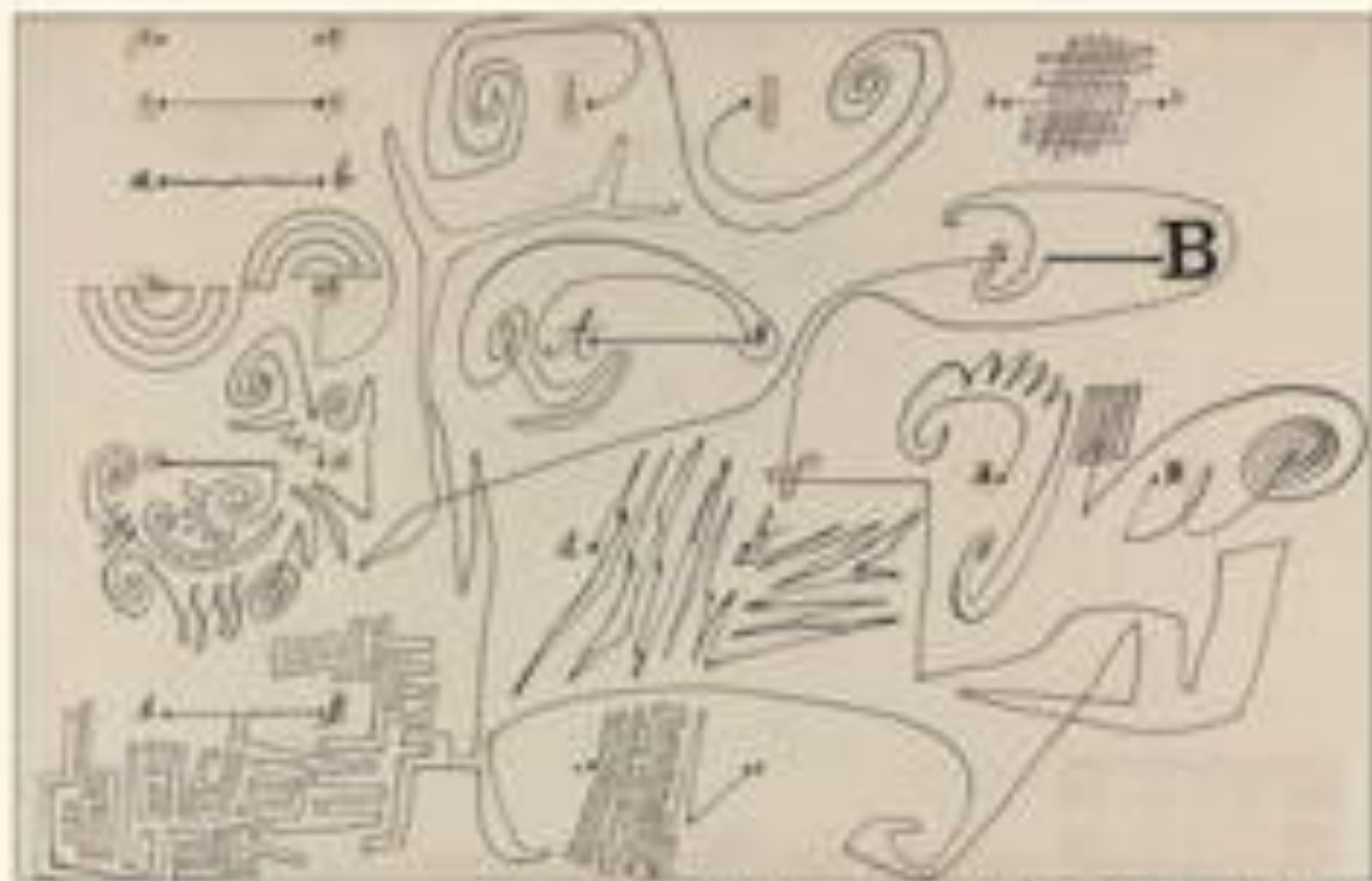
Line drawing of a complex, abstract structure, possibly a diagram or architectural plan, featuring various shapes and lines.