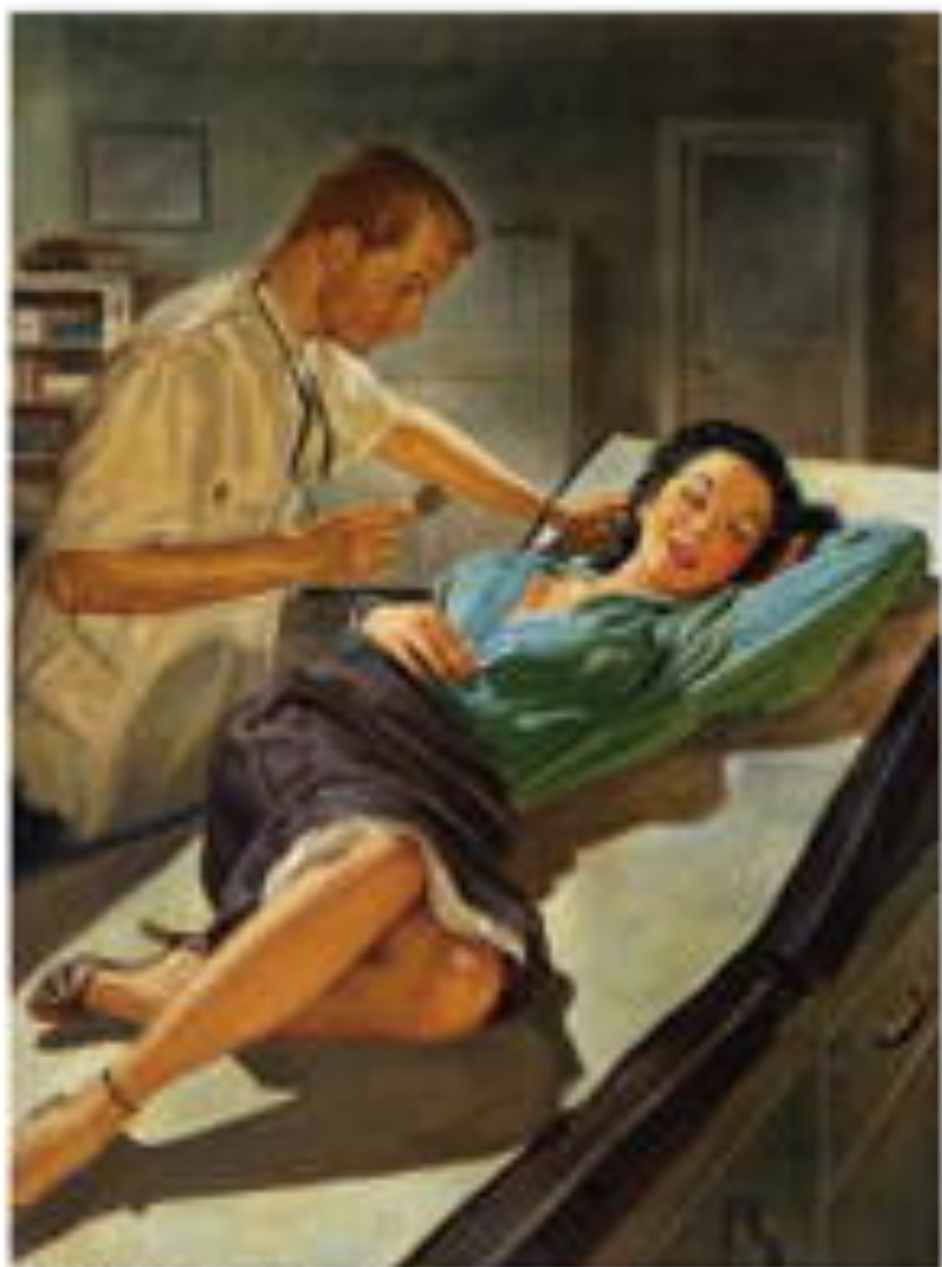
© 2010 The American Medical Association. All rights reserved.