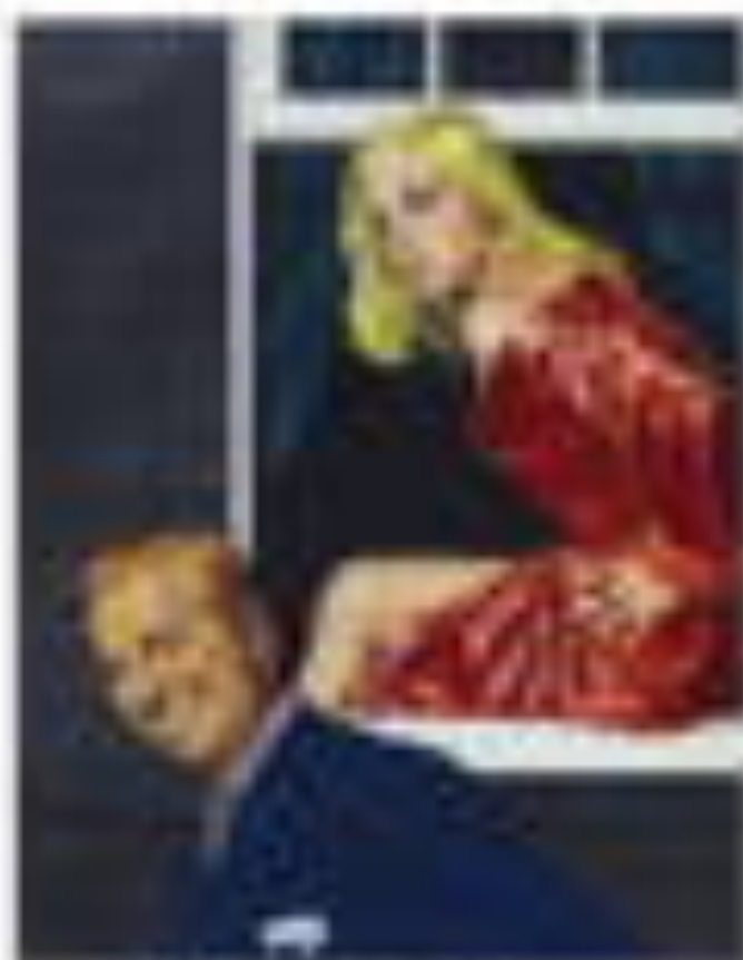
Model: [unreadable] / [unreadable]