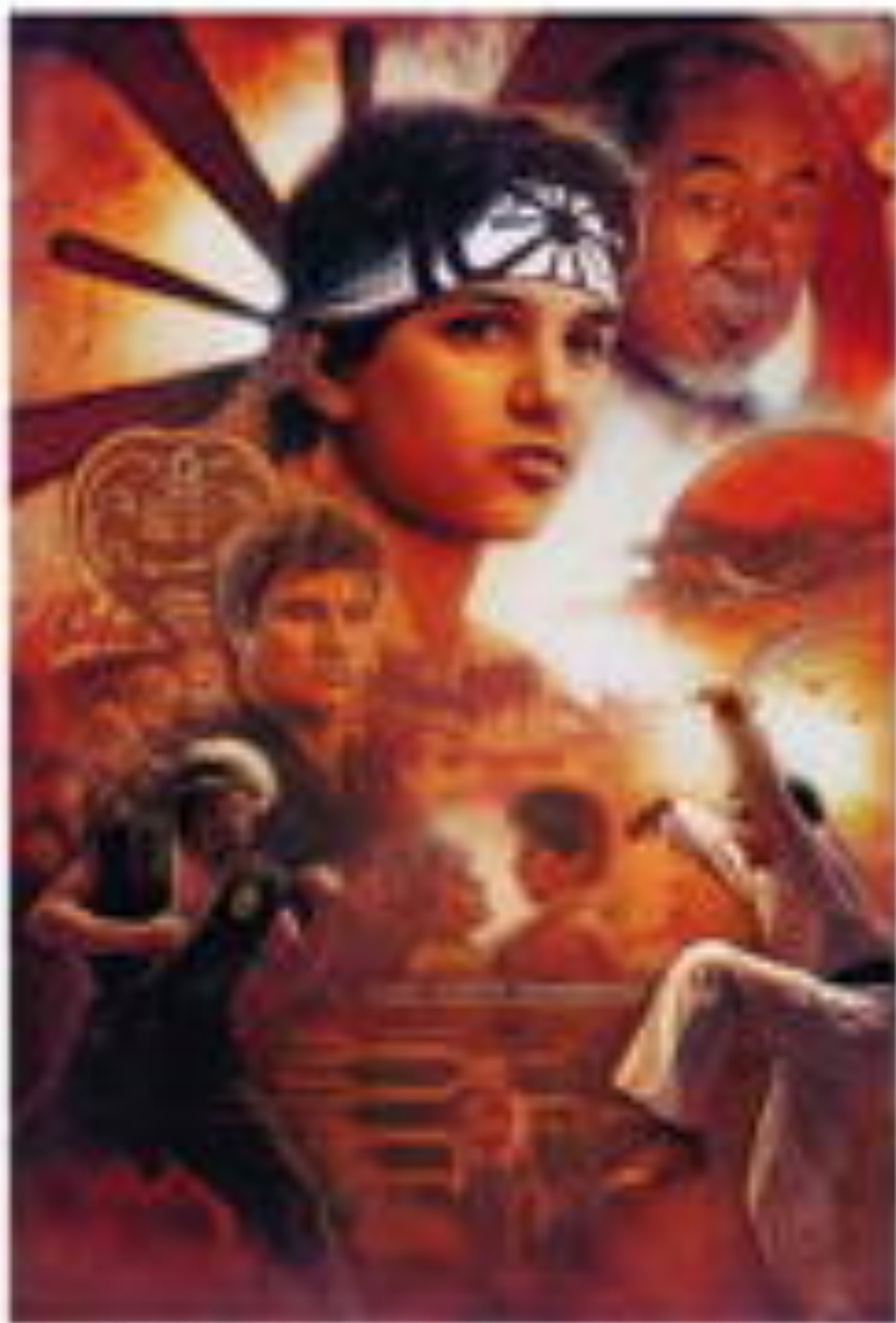
THE KARATE KID