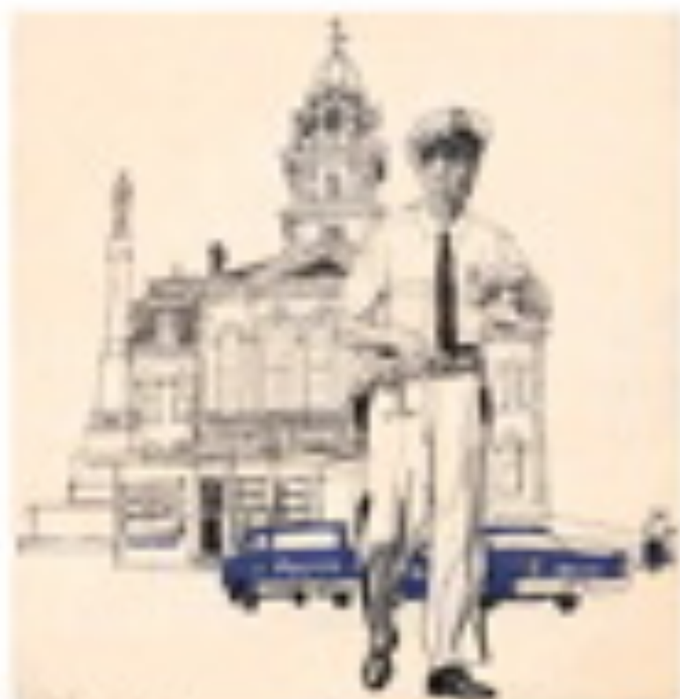
Illustration of a man in a suit standing next to a large, ornate building with a dome and minaret.