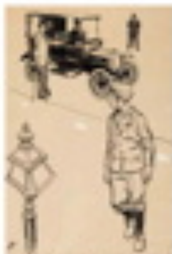
Illustration from page 2 of 'The Little Prince' by Antoine de Saint-Exupéry.

The first illustration shows a young boy in a red cap and white shirt holding a large, red, textured object, possibly a piece of fruit or a model. To his right is a small diagram of a rectangular object with internal lines.