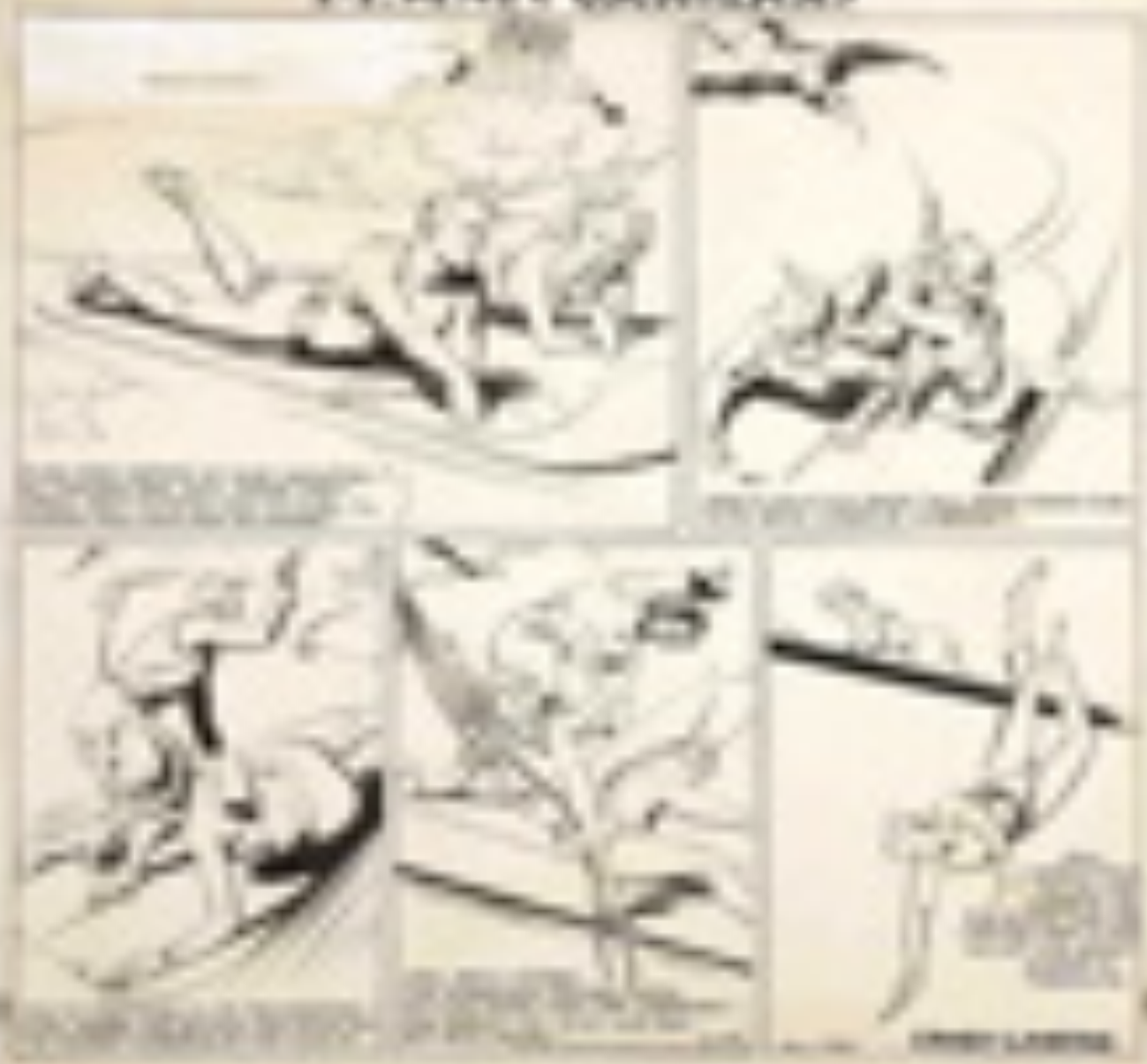
Illustrations of the various styles of the Japanese calligraphic art.

Begin on the other hand, we should realize that the Japanese calligraphic art is not a mere collection of the best specimens of the Chinese, though the two styles are very similar. The Japanese calligraphic art is a new style, which has been developed from the Chinese art, but it is not a mere imitation of the Chinese art.