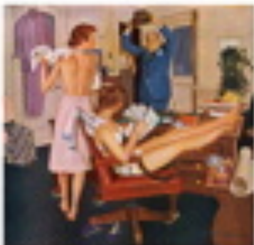
WOMAN RUNNING TO THE BEDROOM, 1988