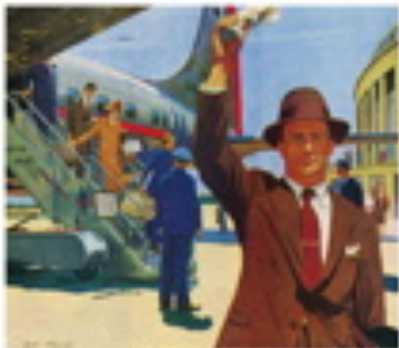
Winning American... (caption text)