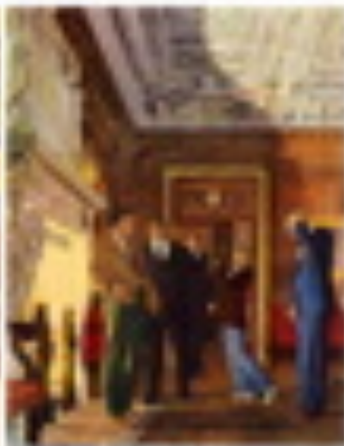
Turner, J.M.W. Rain, Steam, and Great Central Railway Station, 1844

Turner's work is characterized by its use of color and light, and its focus on the everyday scene. He was a pioneer in the use of watercolor as a medium for large-scale paintings.