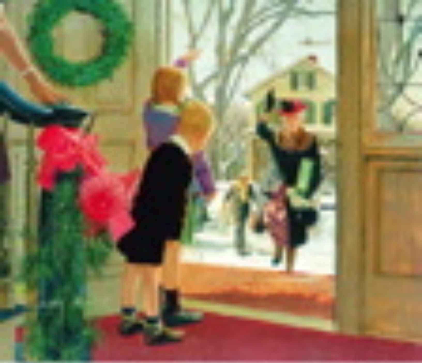
The woman in the doorway is the author's mother.