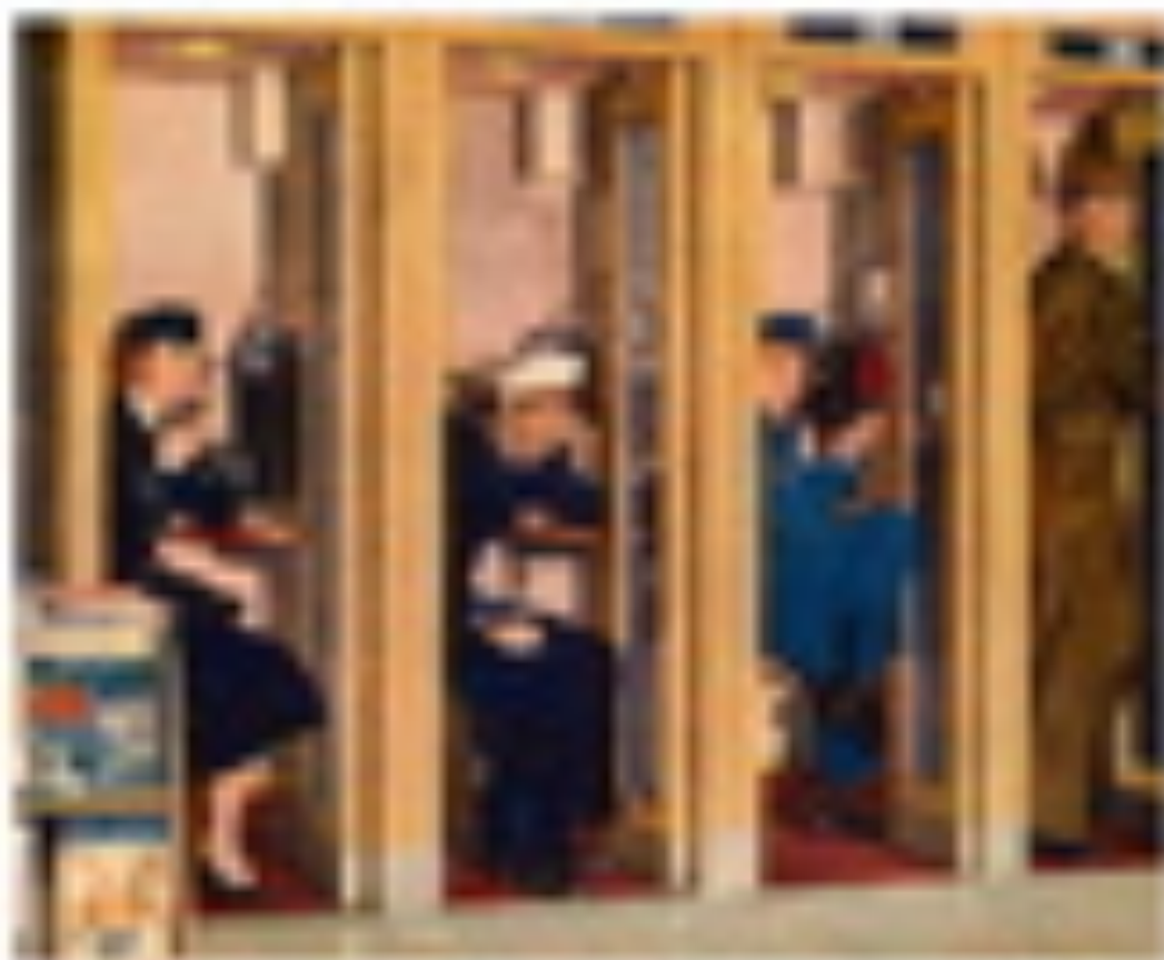
© 2010 The McGraw-Hill Companies, Inc.