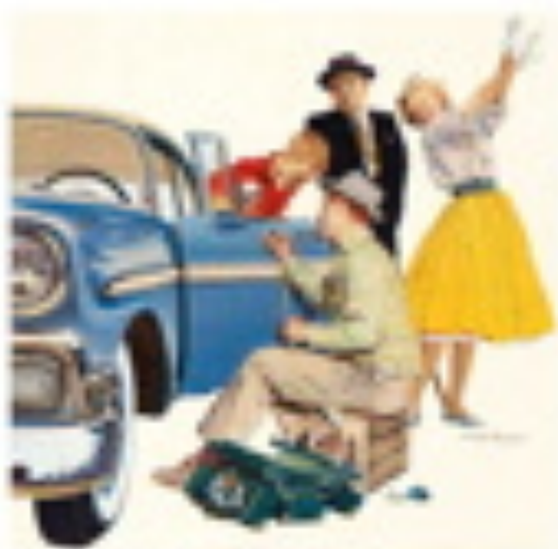
Illustration by [unreadable]