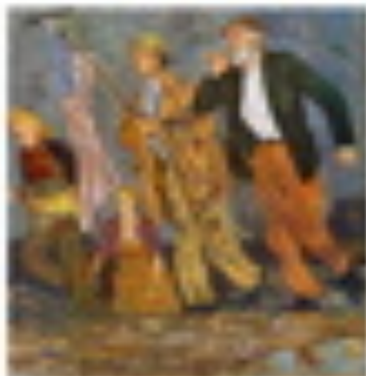
REPRODUCTION OF A PAINTING BY JAMES EARL RAY