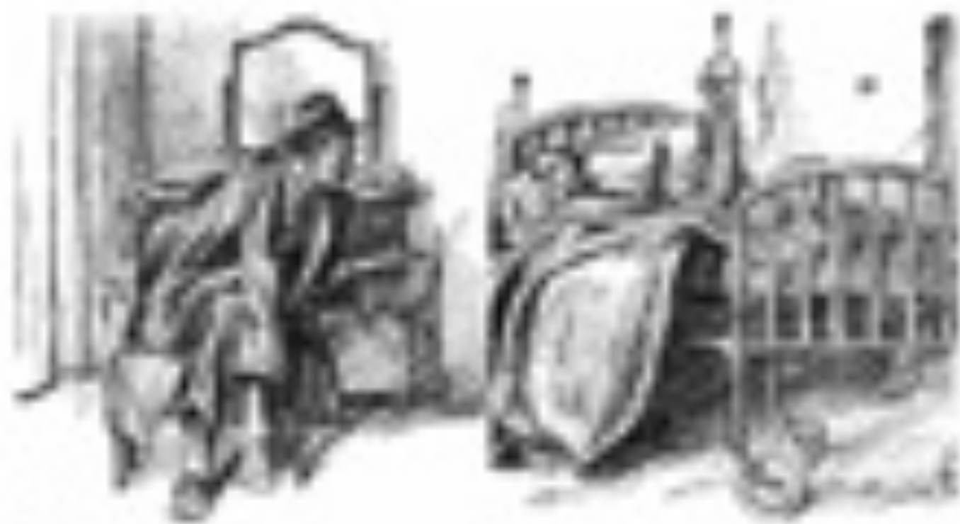
[Faint, illegible text]