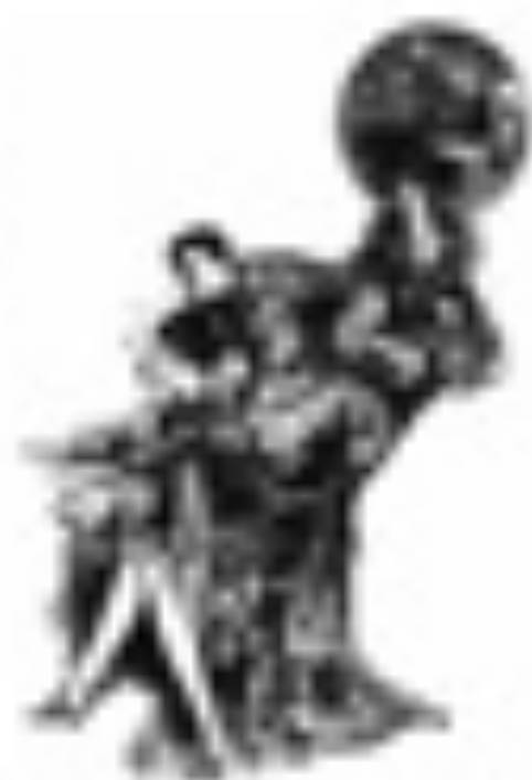
Illustration of a dog sitting on the ground.