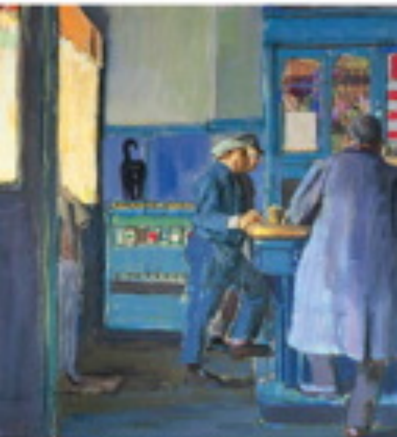
James McNeill Whistler, Interior of a Cafe , 1875. Oil on canvas, 18 1/2 x 24 1/2 inches.