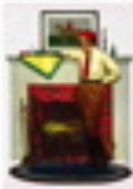
Illustration by Joseph Chapman, 1880 Reproduction of 1880