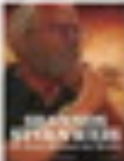
THE GODFATHER PART II 1974