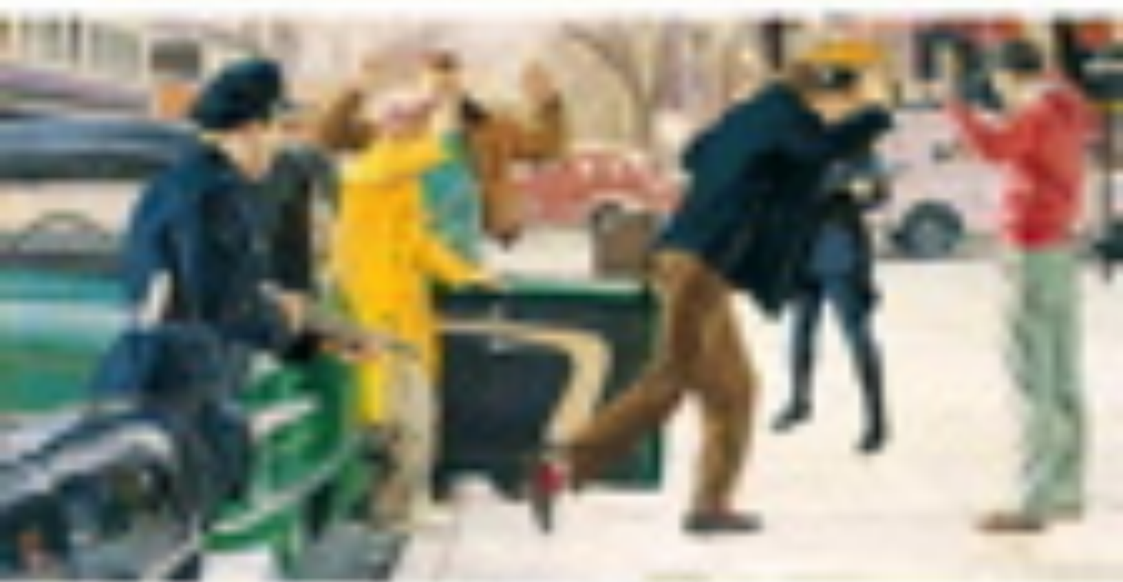
Illustration by [Name] for [Publication]