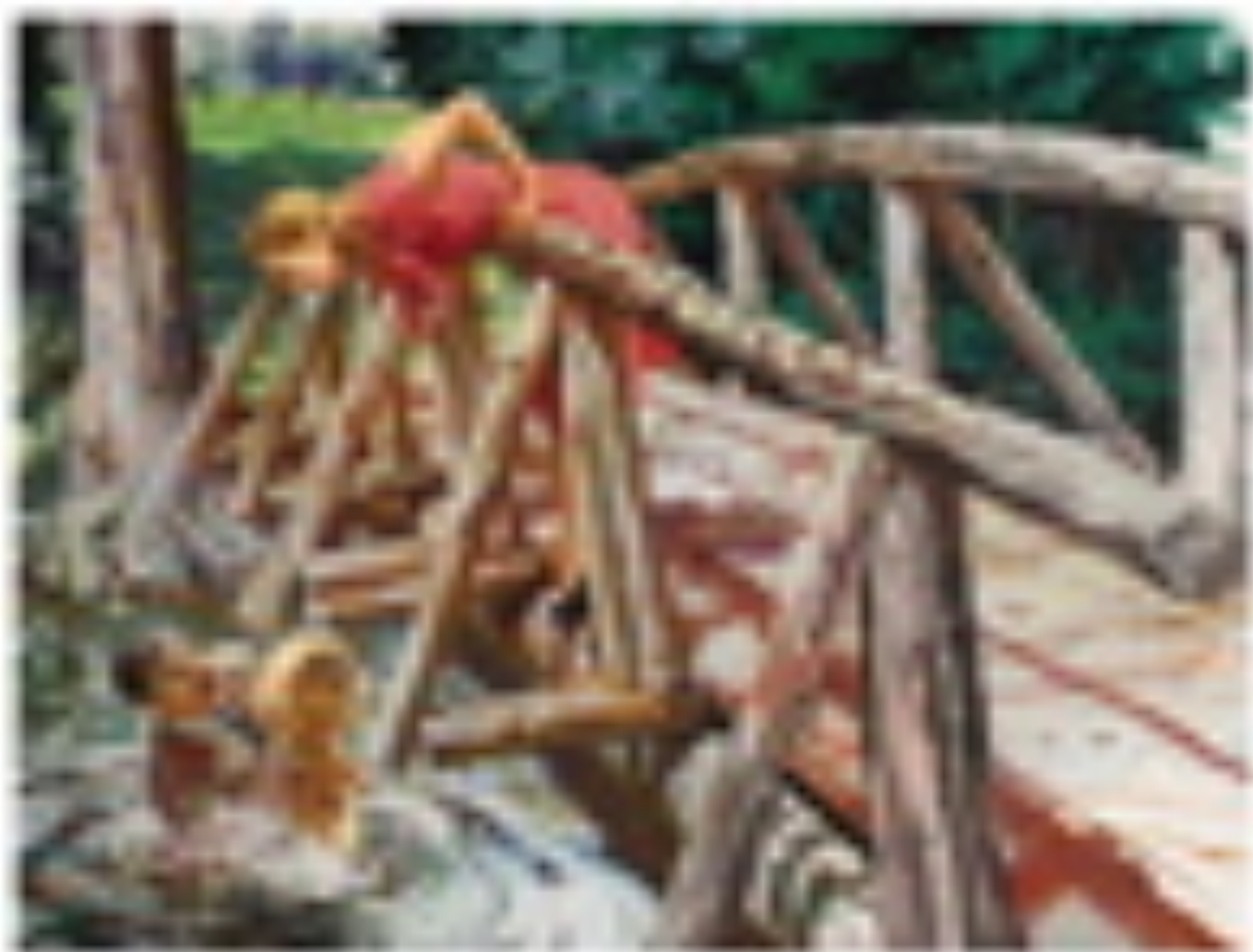
1950s woman climbing a wooden structure at a park in the Los Angeles area.