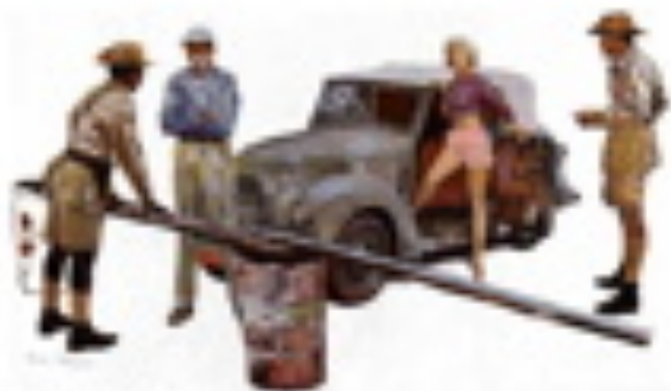
© 2003 Warner Bros. Entertainment Inc. All Rights Reserved.