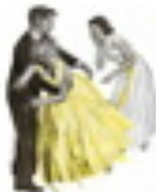
Illustration by [unreadable]