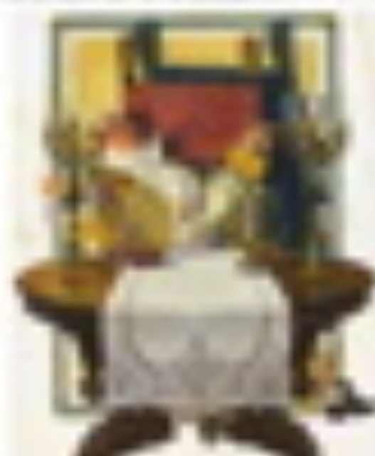
15. LEVONDO 1938 (1974) (copy) Illustrated Gallery