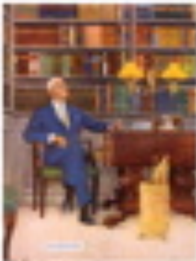
Turner, J.M.W. Rain, Steam, and Great Central Railway Station, 1844

...the man in the blue suit is the artist himself, sitting on a bench in the railway station, looking at a book. The background shows a bookshelf filled with books, and a yellow bag is on the floor next to him. The scene is set in a railway station, with a train visible in the distance.