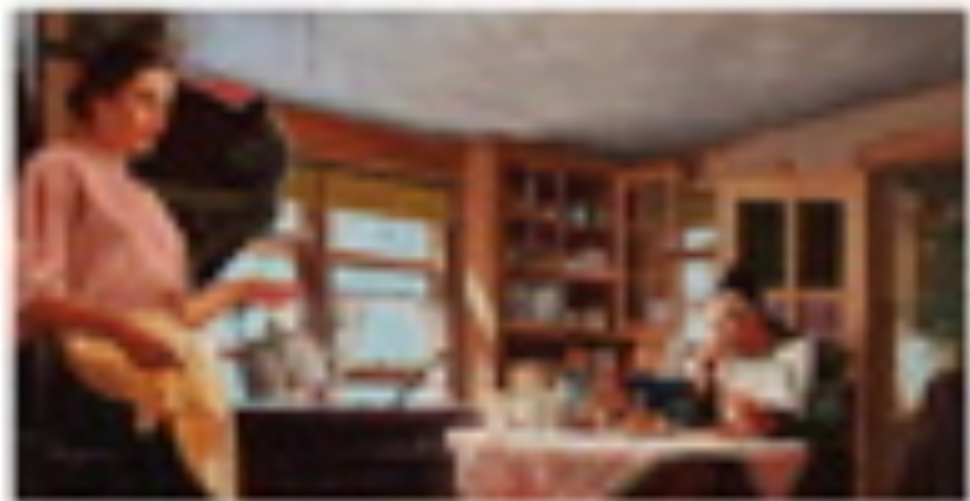
1950s woman in a kitchen in the Los Angeles area.