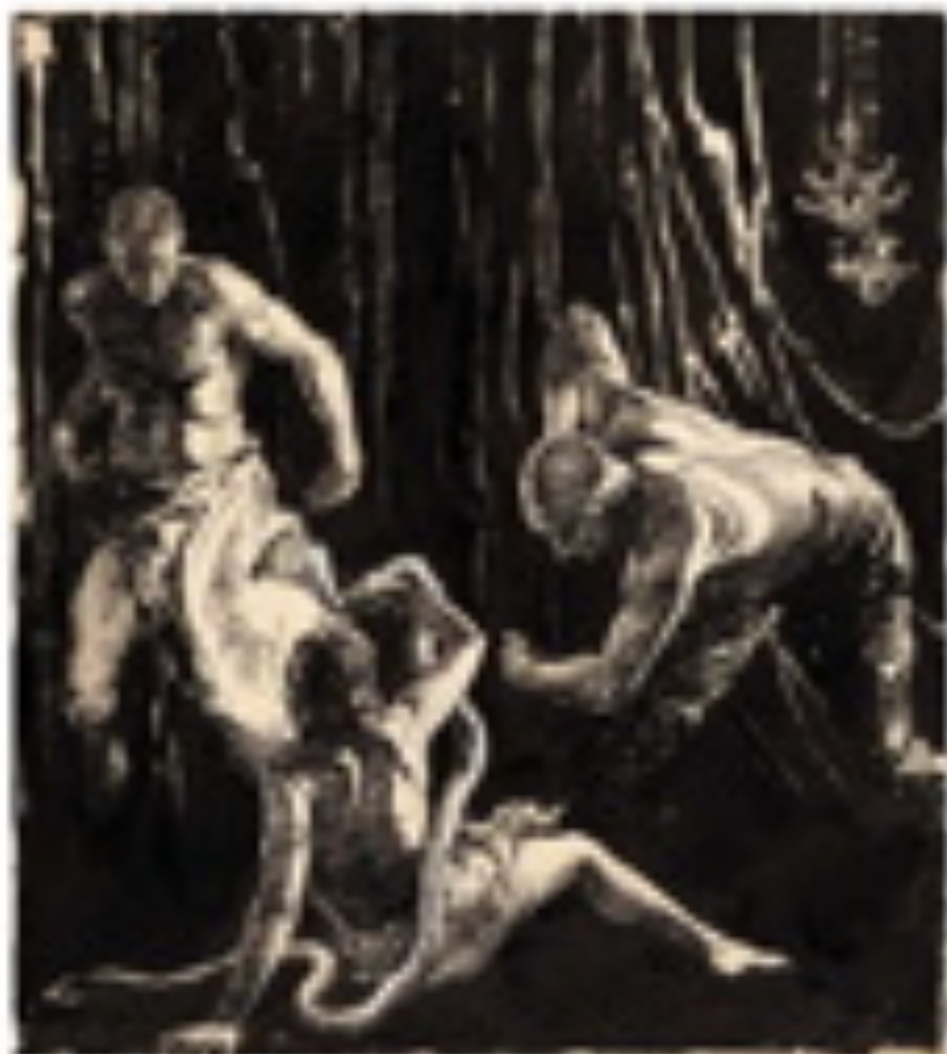
Illustration by the artist showing the scene of the play 'The Conquest of the East'.