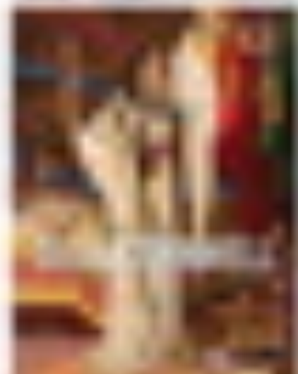
THE GODFATHER PART II 1974