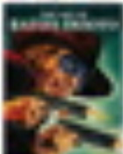
THE GODFATHER PART II 1974