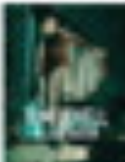
THE GODFATHER PART II 1974