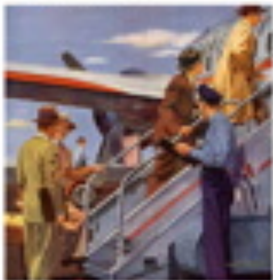
Illustration by [unreadable]