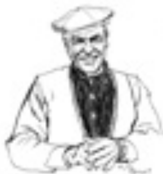
Illustration of a man wearing a cap and a dark vest over a light shirt.