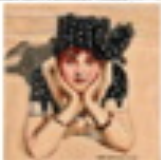
17. LEVONDO 1938 (1974) (copy) Illustrated Gallery