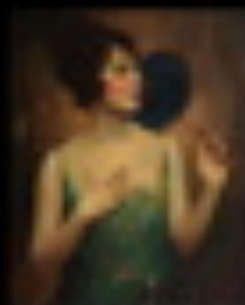
1920s Green Dress $120.00

Original Vintage Lingerie for the Celebrated Age of Illustration