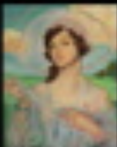
1920s White Dress $120.00