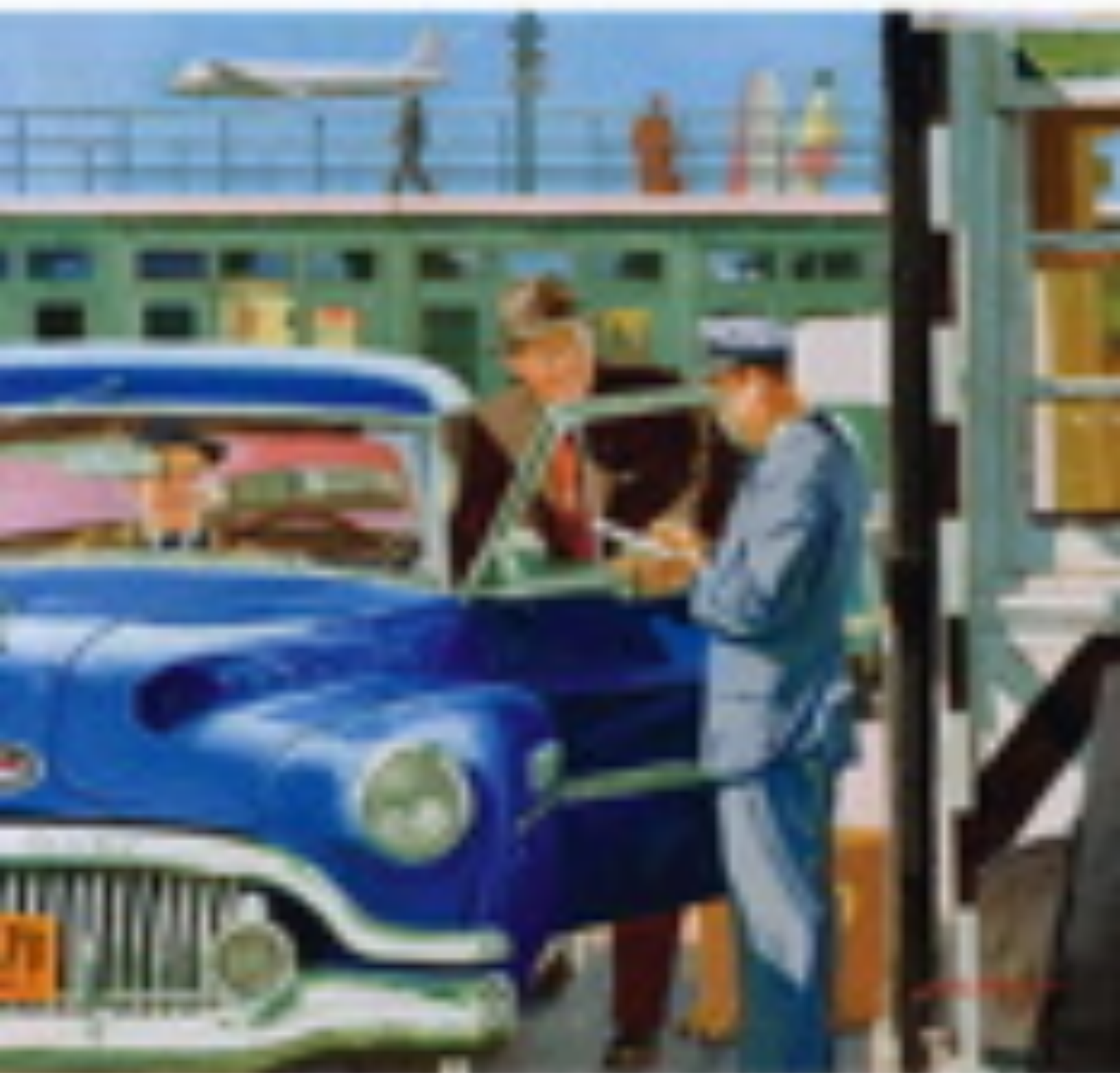
Illustration by [unreadable] for [unreadable] magazine, [unreadable] year.