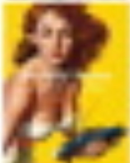
THE GODFATHER PART II 1974