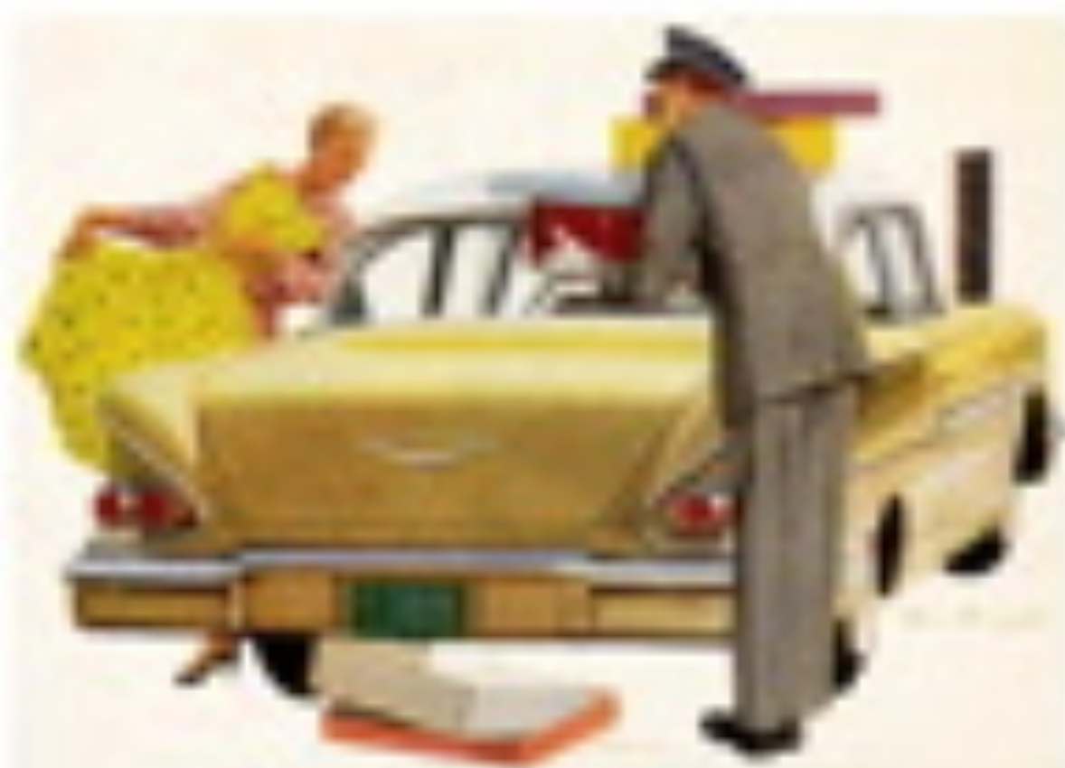
Illustration by Norman Rockwell