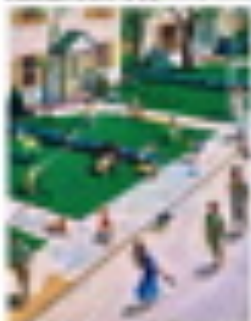
Illustration by Thomas Wee, 1880 Reproduction of 1880