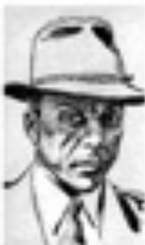
Illustration by [unreadable]

What is the main idea? The main idea of the passage is that the author is describing a scene of physical conflict between three men. The man in the striped shirt is being held from behind by the man in the suit, while the third man is being pushed or held from the side. The author is using descriptive language to convey the intensity of the moment.