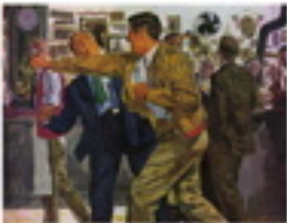
Alvin Karpis (center) is embraced by John Dillinger (right) after their escape from the Chicago Police in 1934.