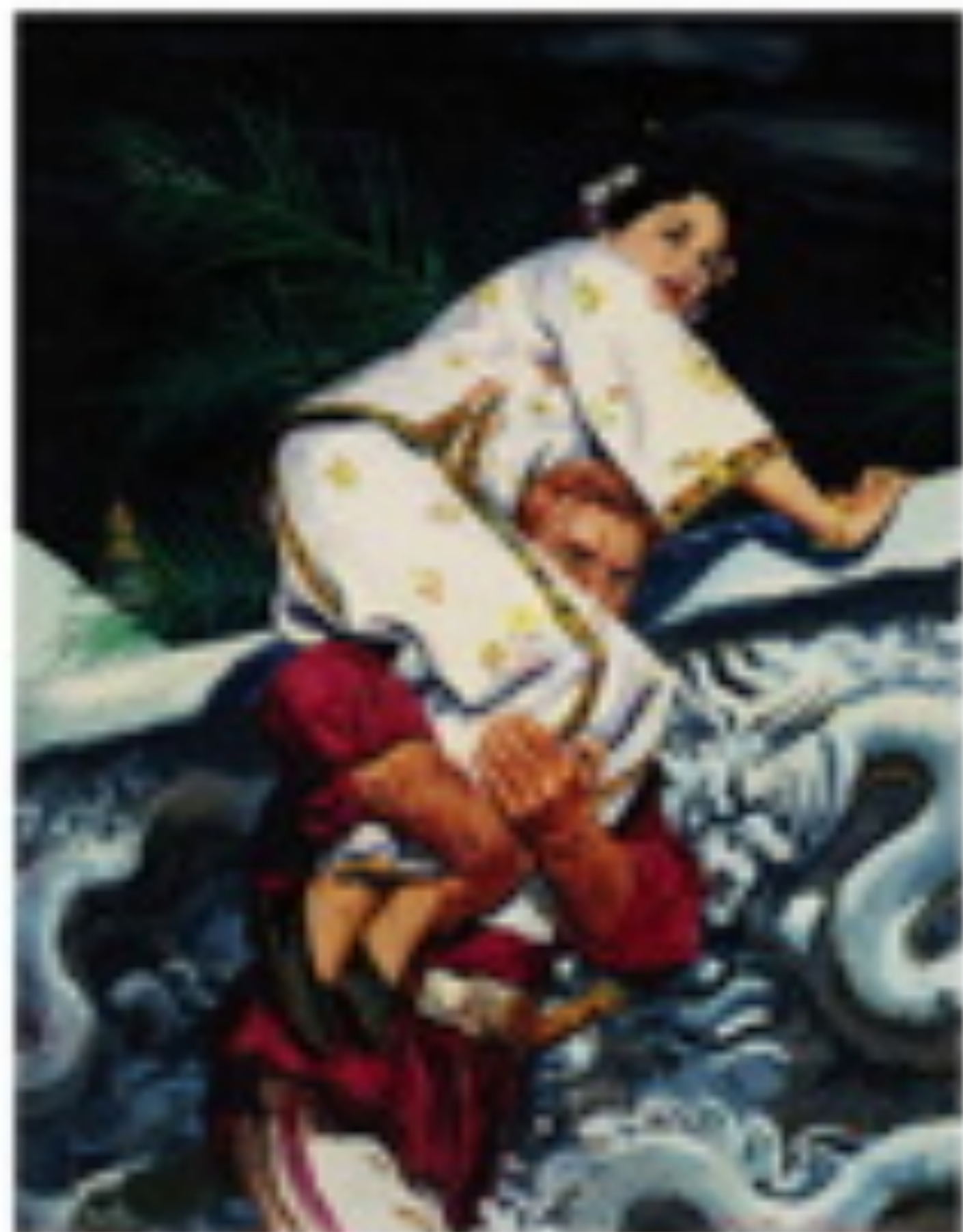
J.M.W. Turner, Rain, Steam, and Great Central Railway, 1844, oil on canvas, 100 x 140 cm, London, National Gallery