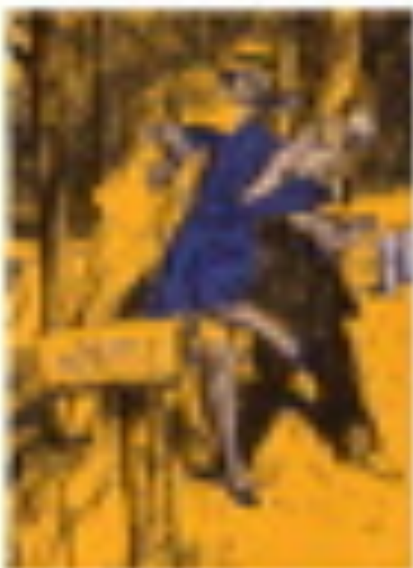
Alvin Karpis (center) is embraced by John Dillinger (right) after their escape from the Chicago Police in 1934.