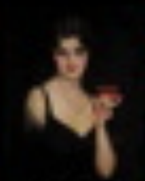
1920s Black Dress $120.00