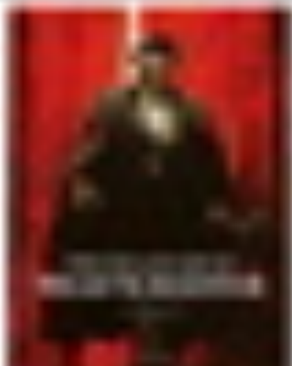
THE GODFATHER 1972