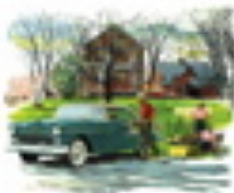
Illustration by [unreadable]