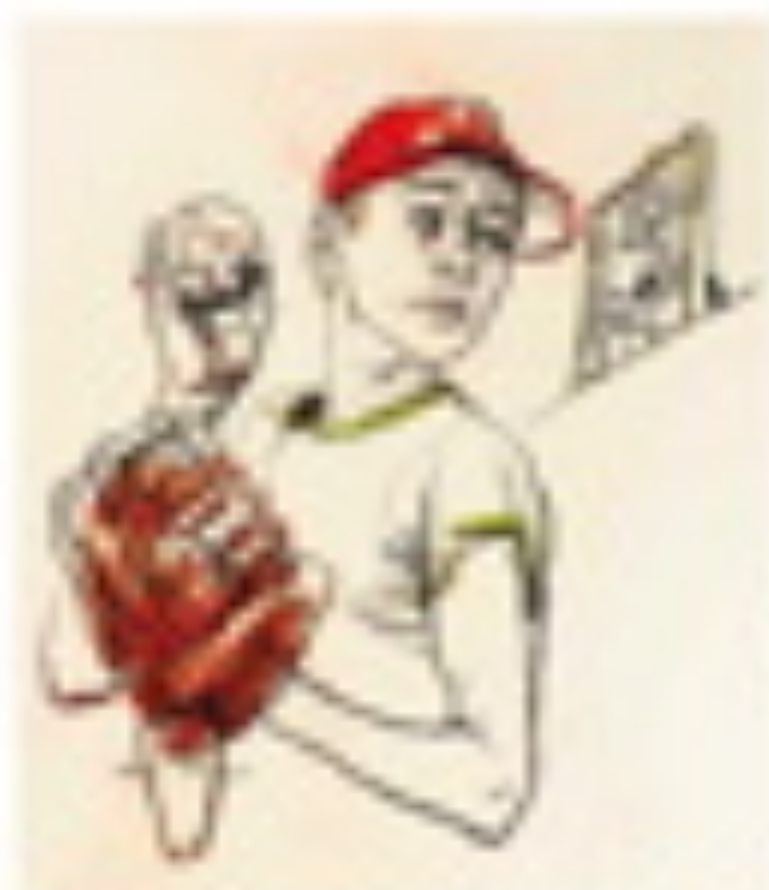
Illustration from page 2 of 'The Little Prince' by Antoine de Saint-Exupéry.