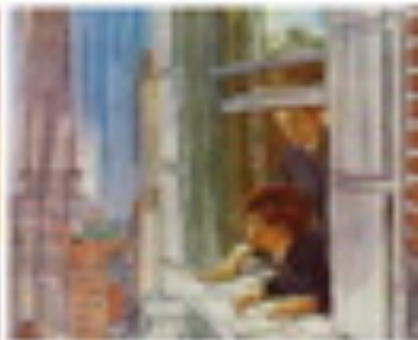
John Constable to the National Gallery, London, 1825