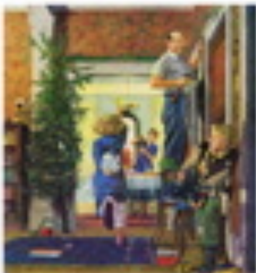
WOMAN RUNNING TO THE BEDROOM, 1988