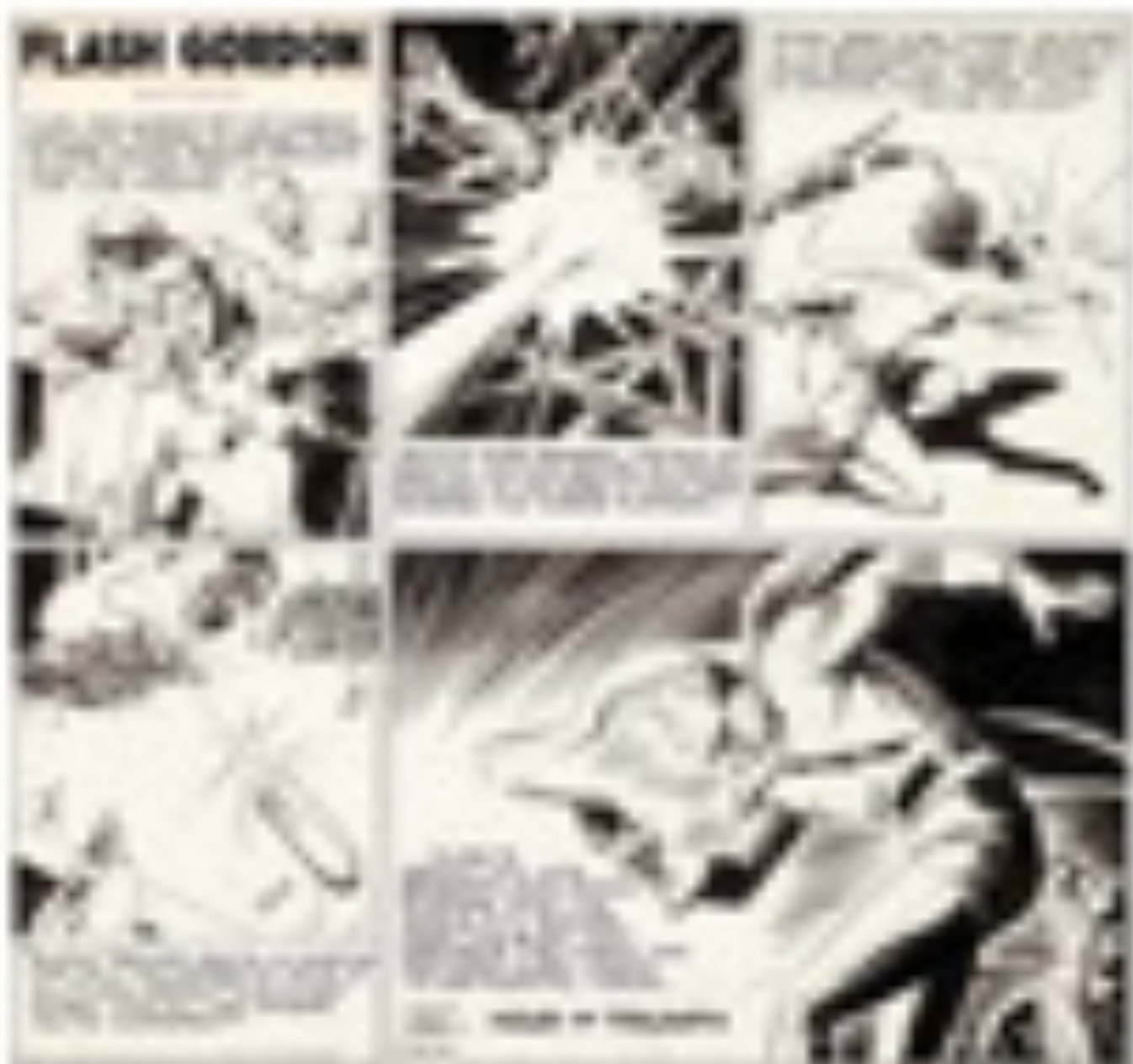
FLASH GORDON AND HIS ADVENTURES IN THE SKY AND THE UNDERGROUND WORLD

Flash Gordon is a character who is a hero of the sky and the underground world. He is a young man who is brave and strong. He has a special power that he uses to fight against the bad guys. He is a hero who is loved by many people. He is a hero who is brave and strong. He has a special power that he uses to fight against the bad guys. He is a hero who is loved by many people.