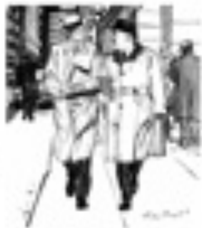
Illustration of a group of people walking in a hallway or corridor.