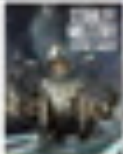
THE GODFATHER PART II 1974