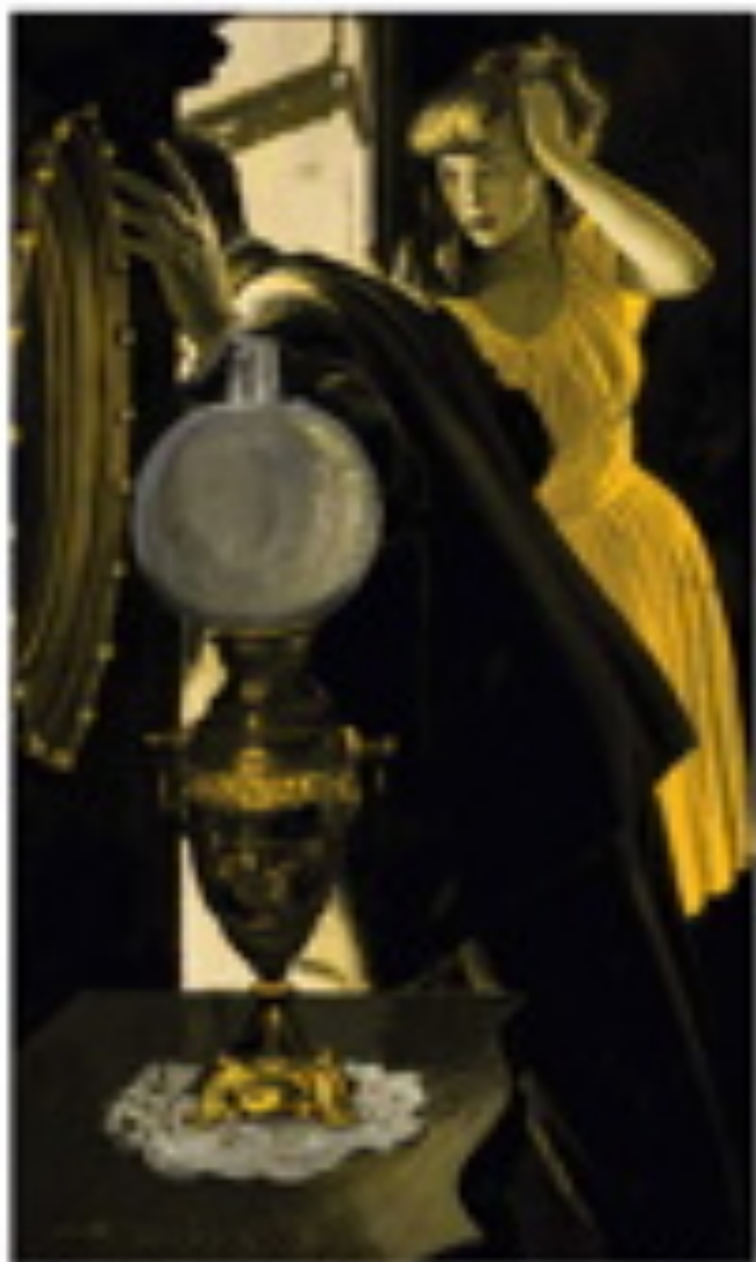
Illustration of a perfume bottle on a decorative stand with a plate of flowers. A woman in a yellow dress stands behind it, looking at the bottle. The scene is set against a dark background with a window in the background.