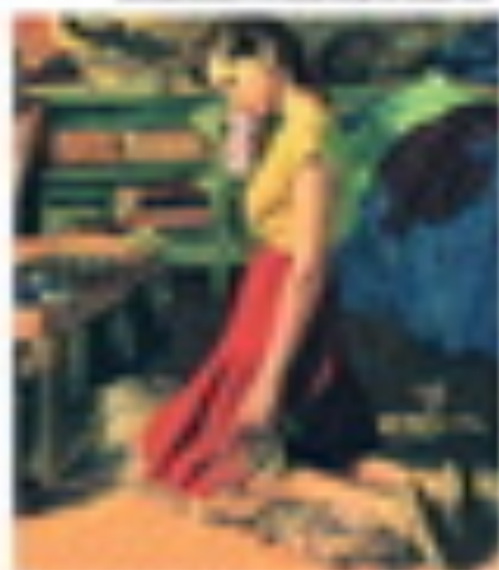
Illustration of a woman in a yellow top and red skirt standing in a room, looking at a large green fabric hanging on the wall.