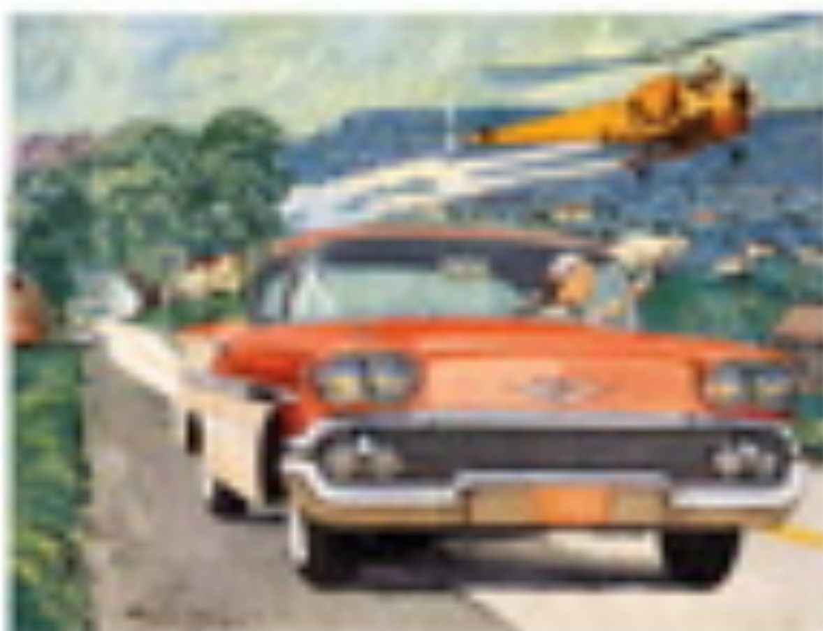
Illustration by Norman Rockwell