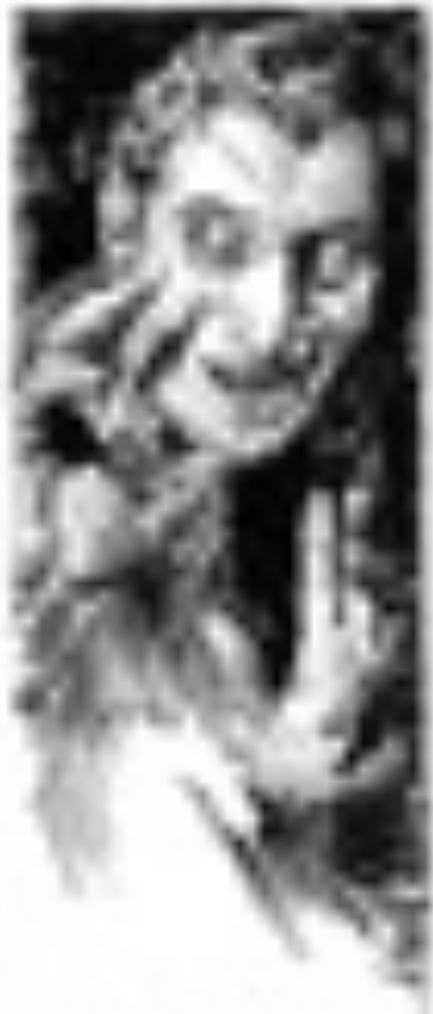
[Faint, illegible text]