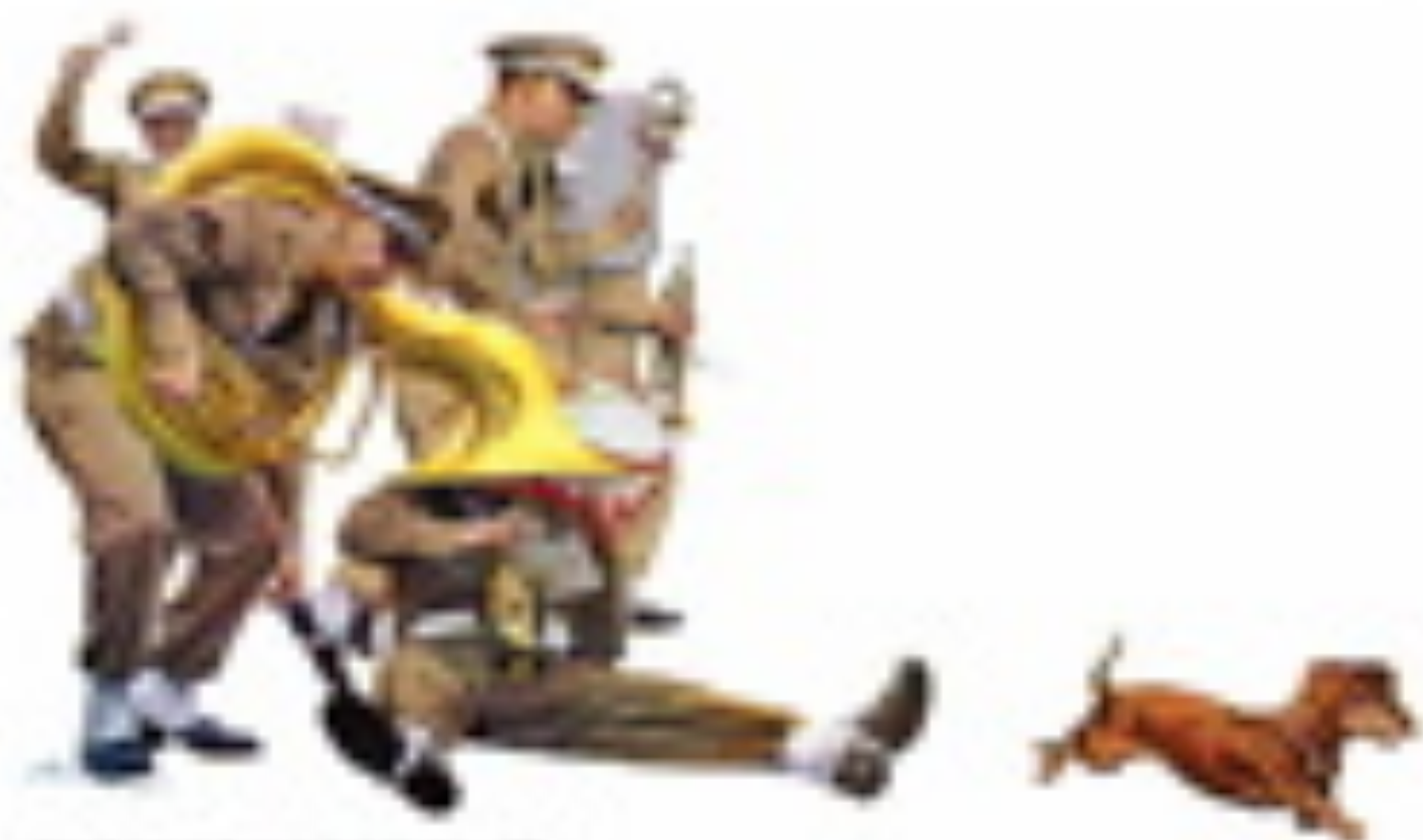
Illustration by the author for the book 'The War of Wits'.

In the end, the author's intention is to show that the war is not just about the physical struggle, but also about the mental and emotional aspects of the conflict. The author's goal is to provide a comprehensive and engaging look at the war, from the perspective of the soldiers and the civilians who supported them.