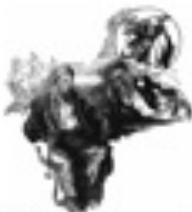
Illustration by [unreadable]

The show was a huge success with the crowd of people in the city. The cowboy's energy and skills made the crowd roar and cheer. Long, long ago, the cowboy was the hero of the west, and the cowboy was the hero of the west. The cowboy was the hero of the west, and the cowboy was the hero of the west. The cowboy was the hero of the west, and the cowboy was the hero of the west.