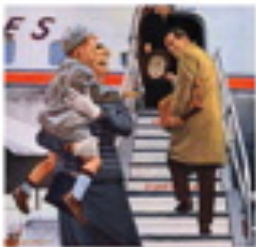
Illustration by [unreadable]