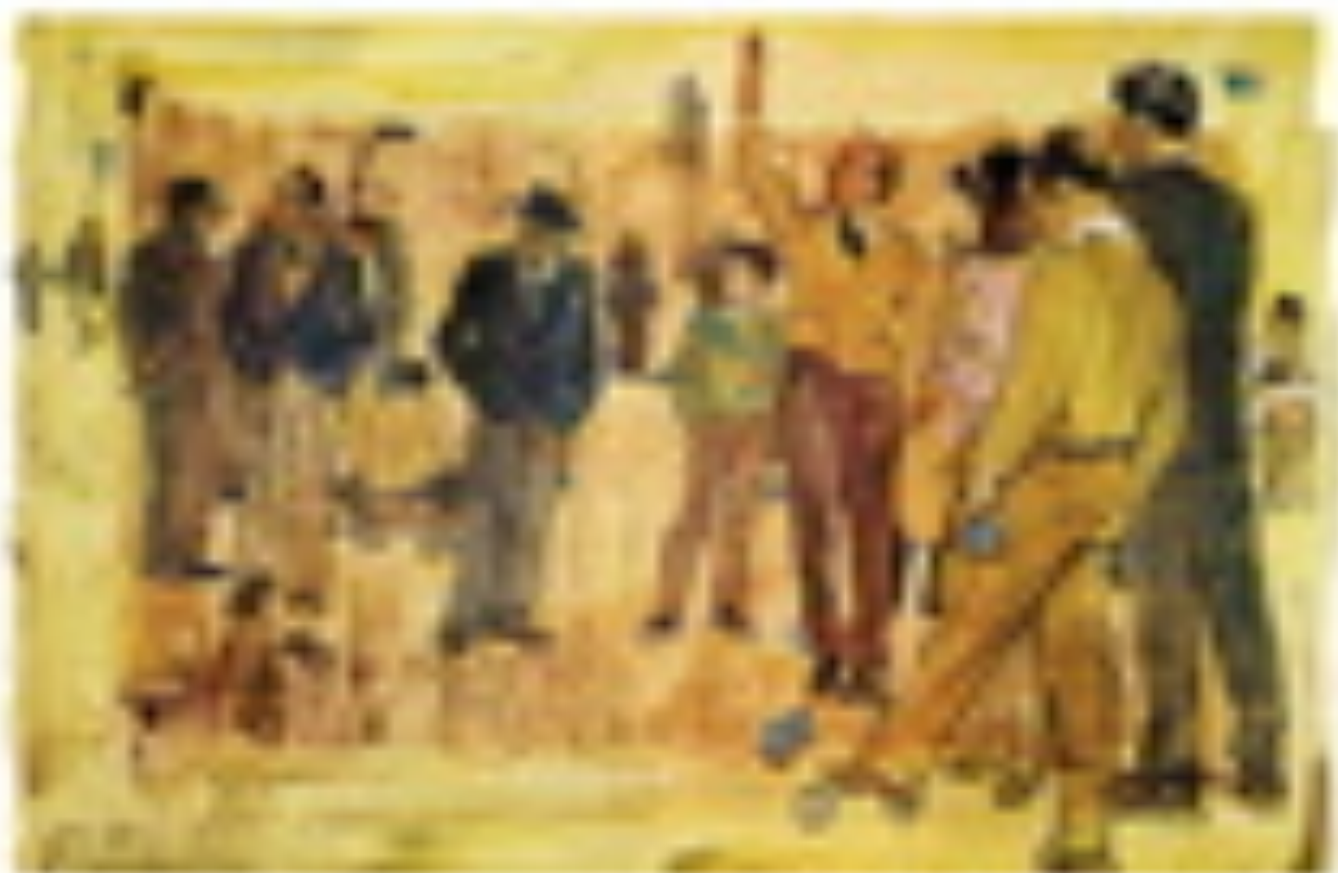
Black market in Berlin, 1945

...the first time in the history of the world that a large number of people were able to buy and sell goods and services in a free market. The market was not a black market, but a free market, and it was the first of its kind in the world.