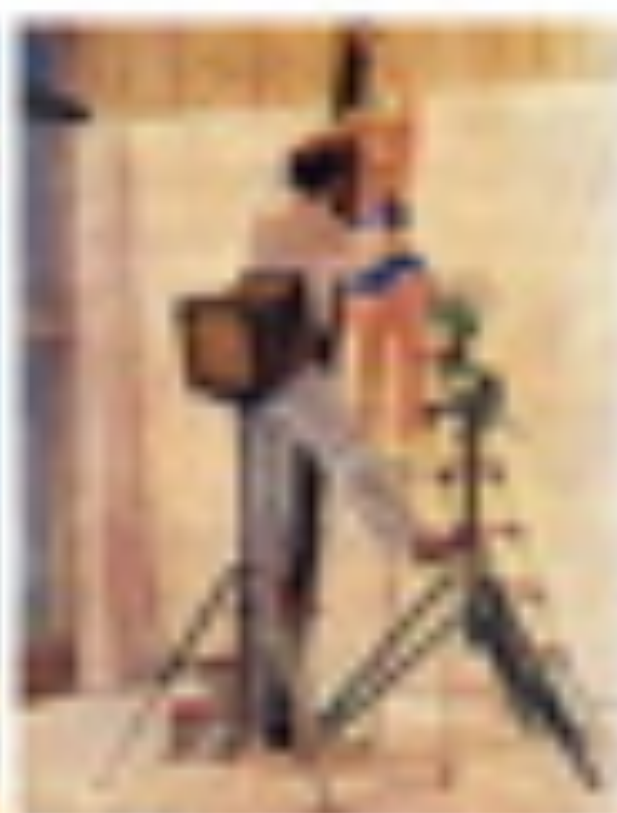
Illustration of a woman in a light-colored top and dark pants standing in a room, looking at a large white fabric hanging on the wall. A black tripod is visible in the foreground.