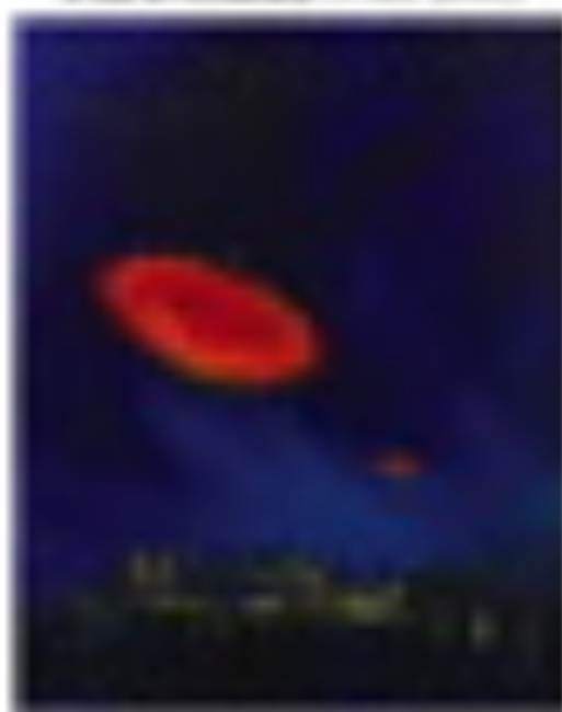
Illustration by Phil Calle, 1880 Reproduction of 1880