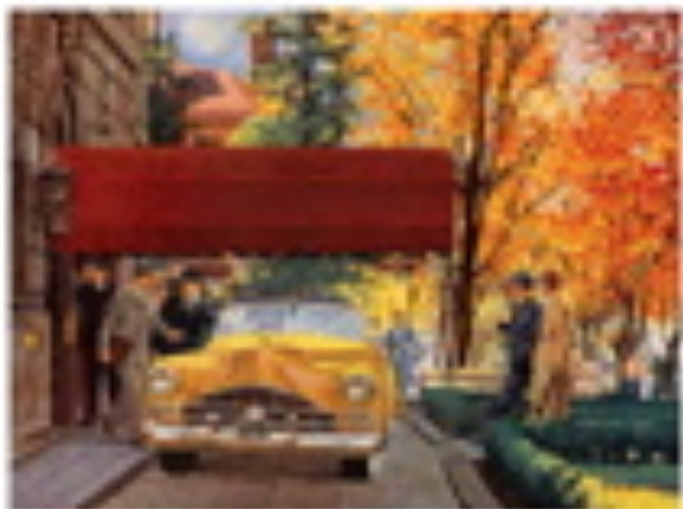
Autumn Street, by J.M.W. Turner, 1845

The scene is a busy city street in autumn. A yellow taxi is the central focus, parked on the sidewalk. The scene is filled with people in period clothing, trees with vibrant orange and yellow leaves, and a large red sign above the taxi. The style is reminiscent of a classic oil painting.