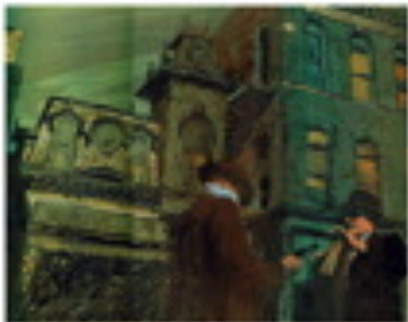
John Constable to the National Gallery, London, 1825