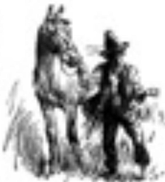
Illustration by [unreadable]

When the cowboy was the hero of the west, the cowboy was the hero of the west. The cowboy was the hero of the west, and the cowboy was the hero of the west. The cowboy was the hero of the west, and the cowboy was the hero of the west. The cowboy was the hero of the west, and the cowboy was the hero of the west. The cowboy was the hero of the west, and the cowboy was the hero of the west. The cowboy was the hero of the west, and the cowboy was the hero of the west.