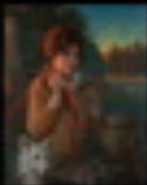
1920s White Dress $120.00

Thank you! We hope you love our vintage lingerie as much as we do!