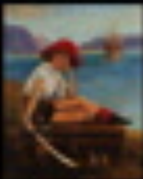
1920s White Dress $120.00