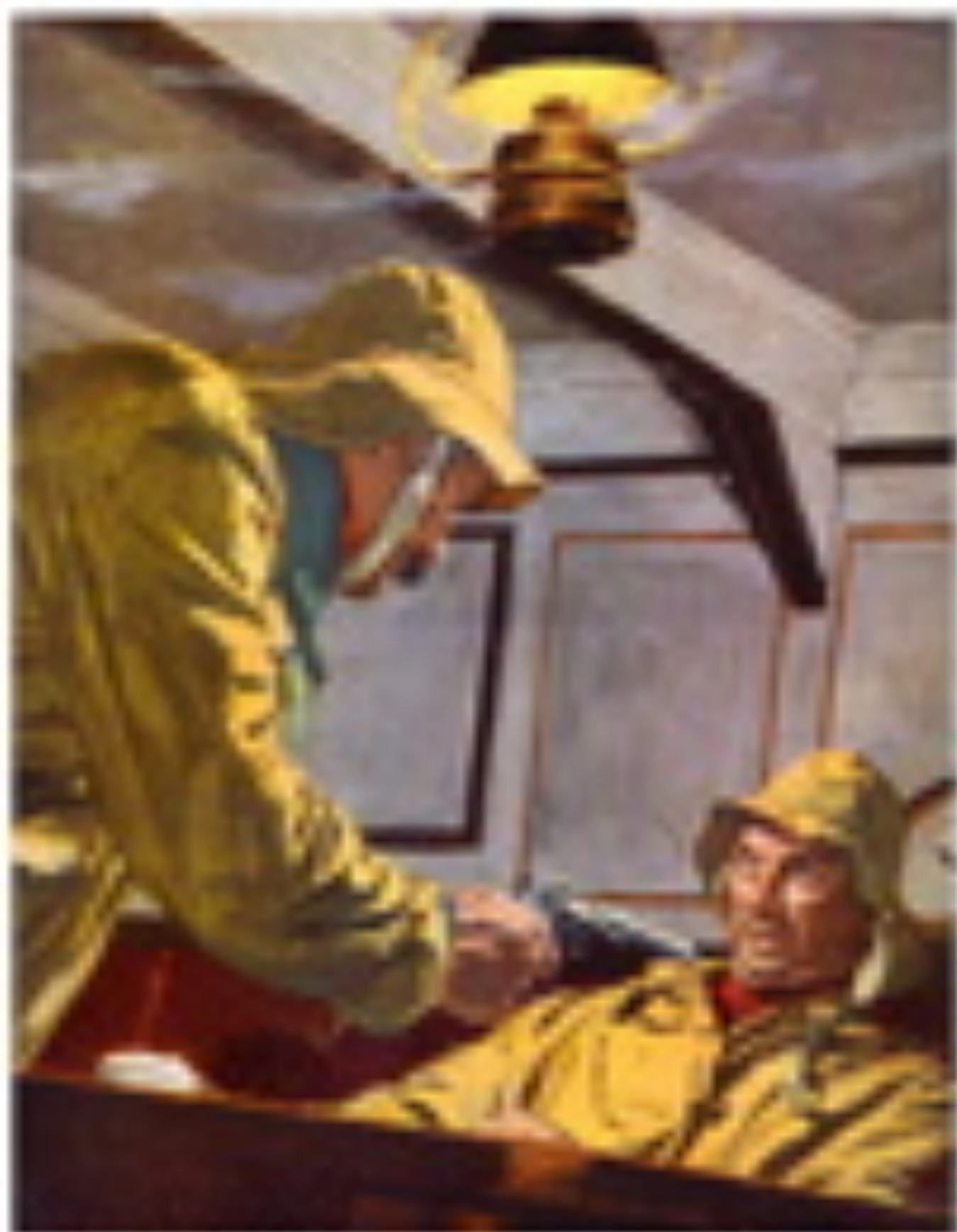
THE MAN IN THE YELLOW RAINCOAT