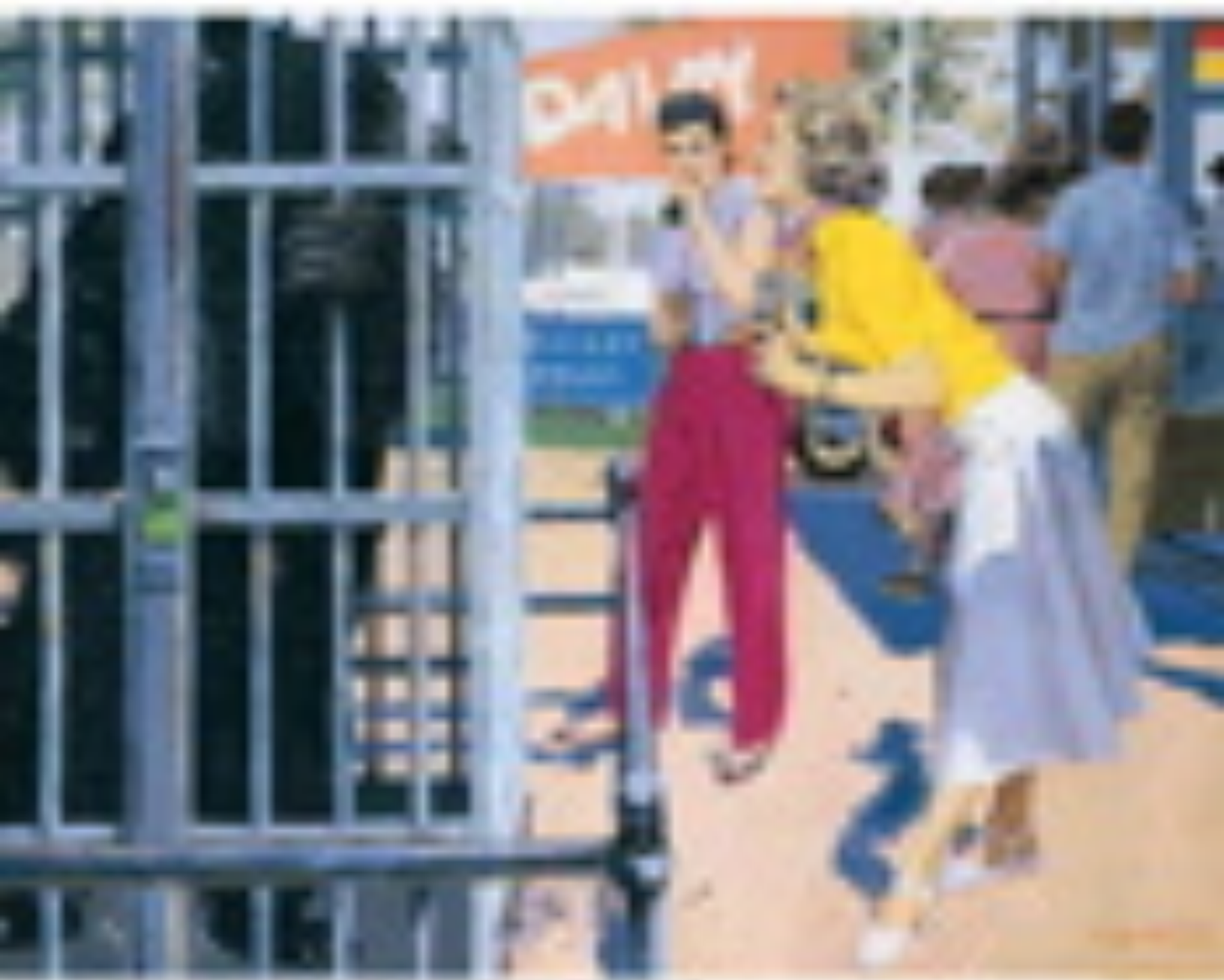
Il gruppo di danza "Daley" durante una performance a Milano.

Il gruppo di danza "Daley" durante una performance a Milano. La coreografa, che ha studiato in Spagna, ha creato una coreografia che mescola le tecniche della danza spagnola con quelle della danza contemporanea. La coreografia è stata creata in collaborazione con il coreografo spagnolo. Il gruppo di danza è composto da sei ragazze e due ragazzi.