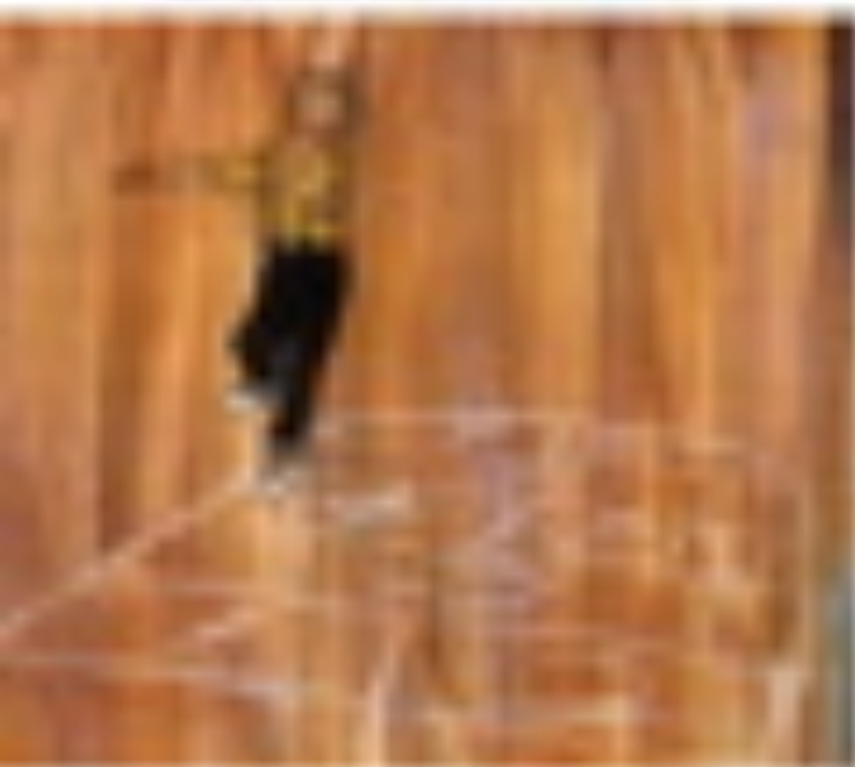
John Constable to the National Gallery, London, 1825