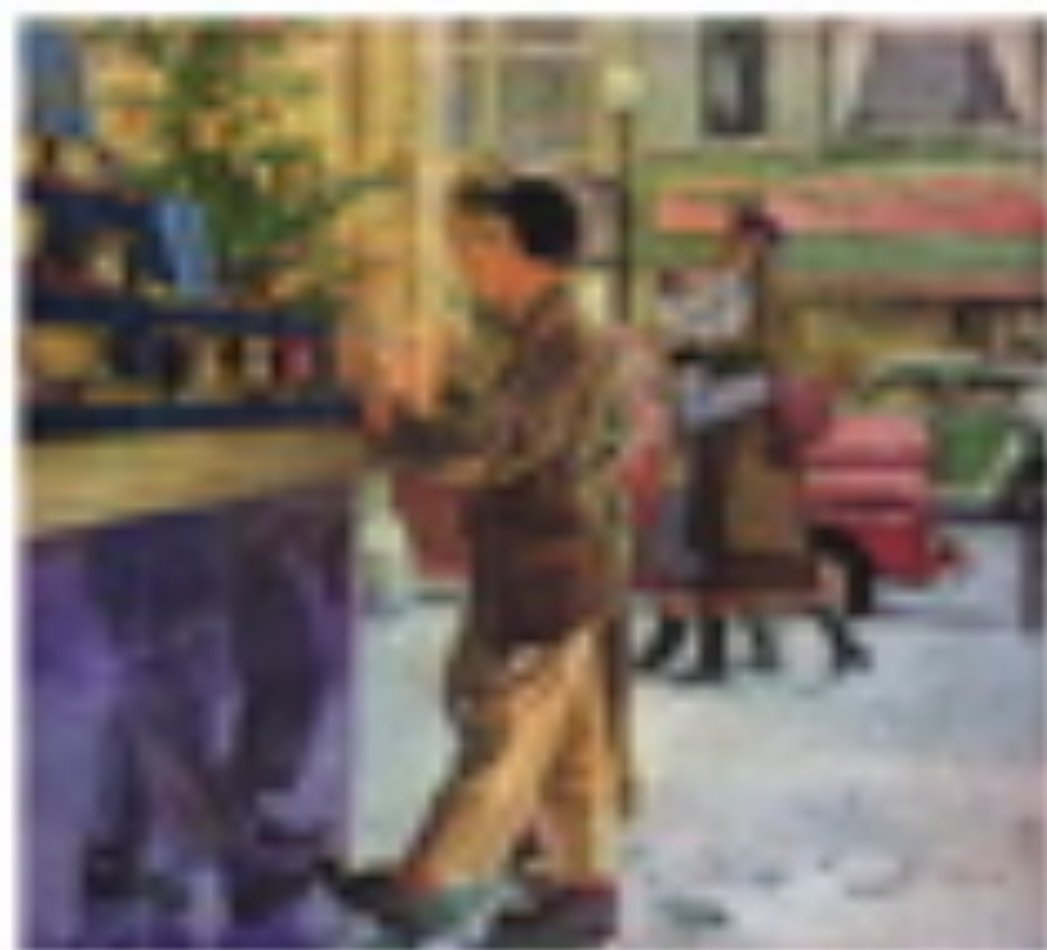
Illustration of a man in a brown jacket and tan pants standing in a room, looking at a large purple fabric hanging on the wall. In the background, a woman in a pink dress is seated at a table.