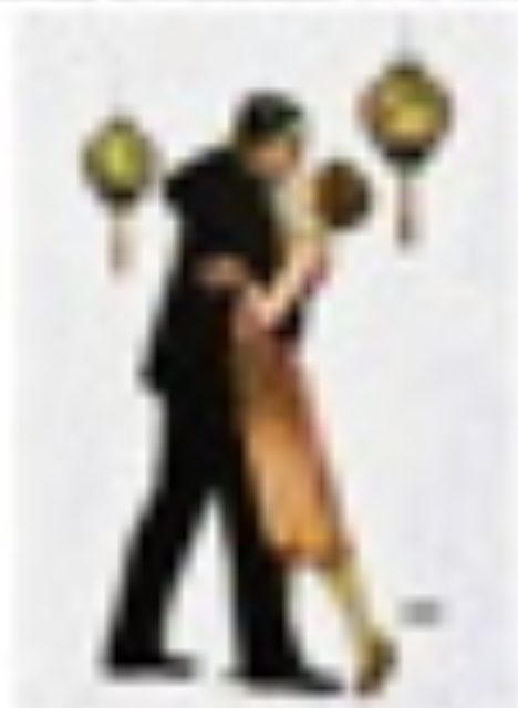
Illustration by Joseph Chapman, 1880 Reproduction of 1880