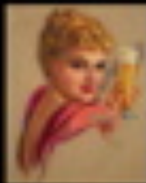
1920s Pink Dress $120.00