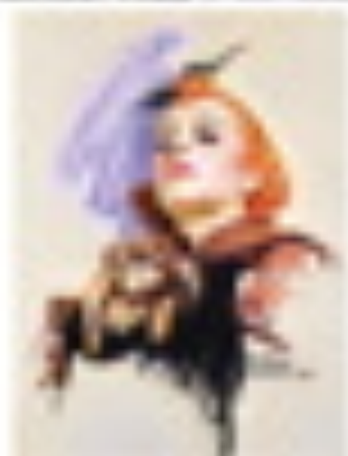
16. LEVONDO 1938 (1974) (copy) Illustrated Gallery