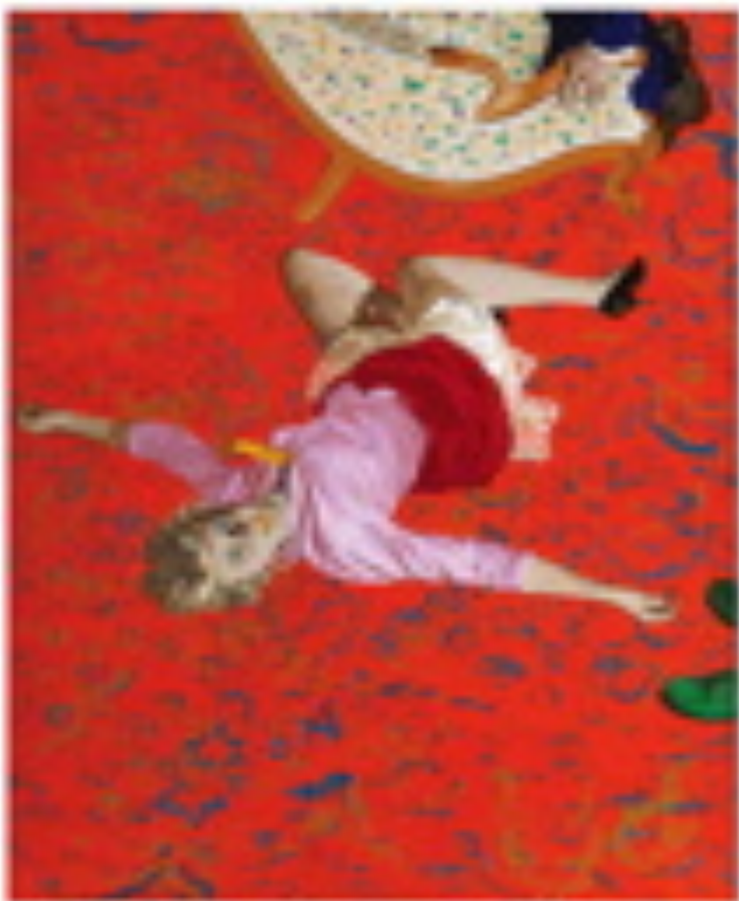
A woman dances in a red room. Vincent van Gogh, 1888. Musée d'Orsay, Paris.